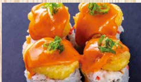
Popcorn Shrimp Roll