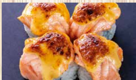
*Baked Salmon Roll