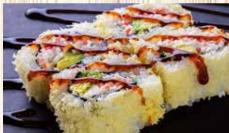
Crunchy California Roll