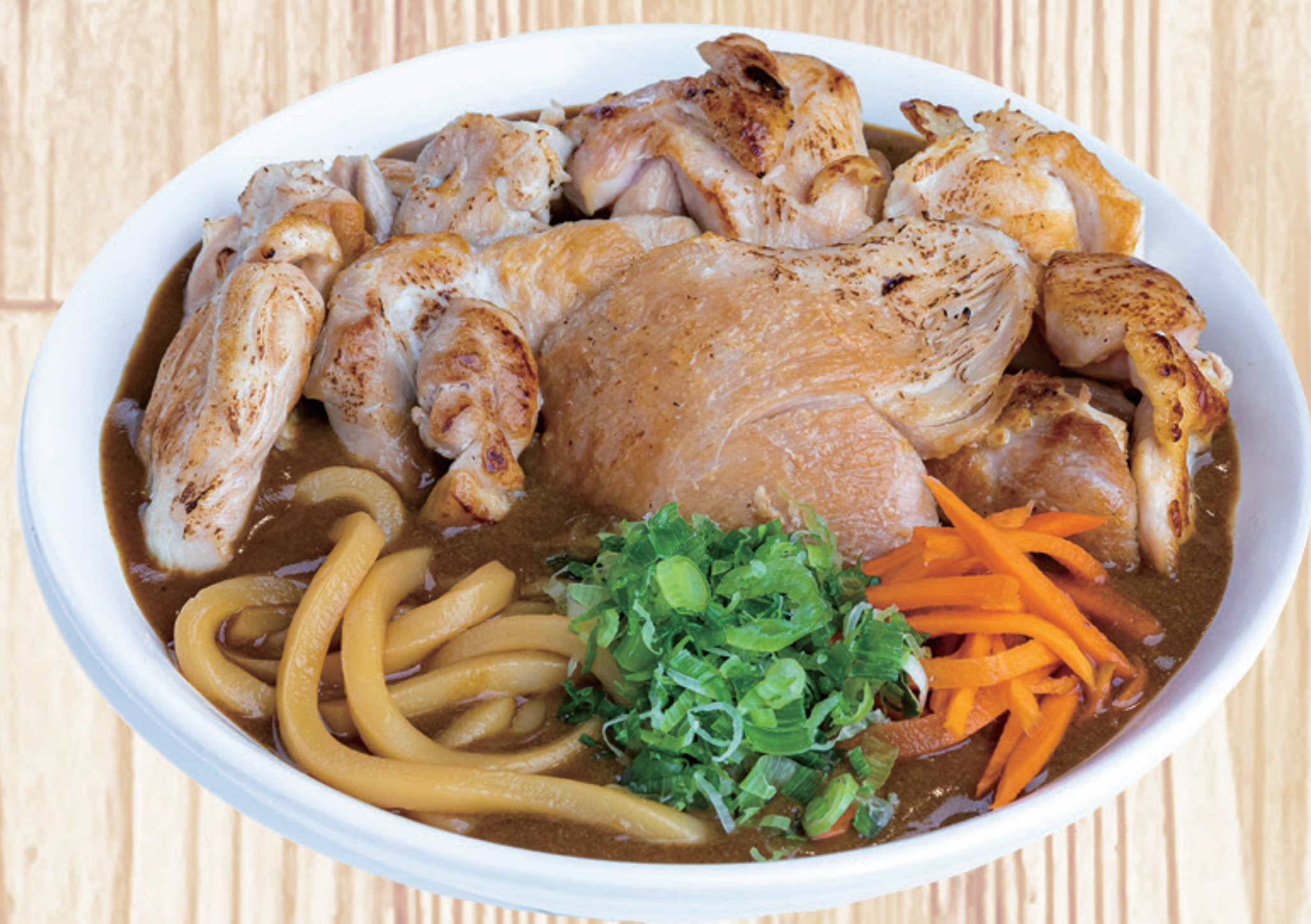
Chicken Grilled Curry Udon $19.65