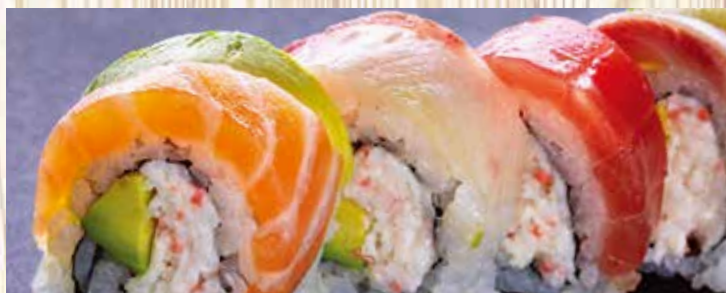
*Rainbow Roll California roll. Topped with salmon, tuna, yellowtail, and avocado.