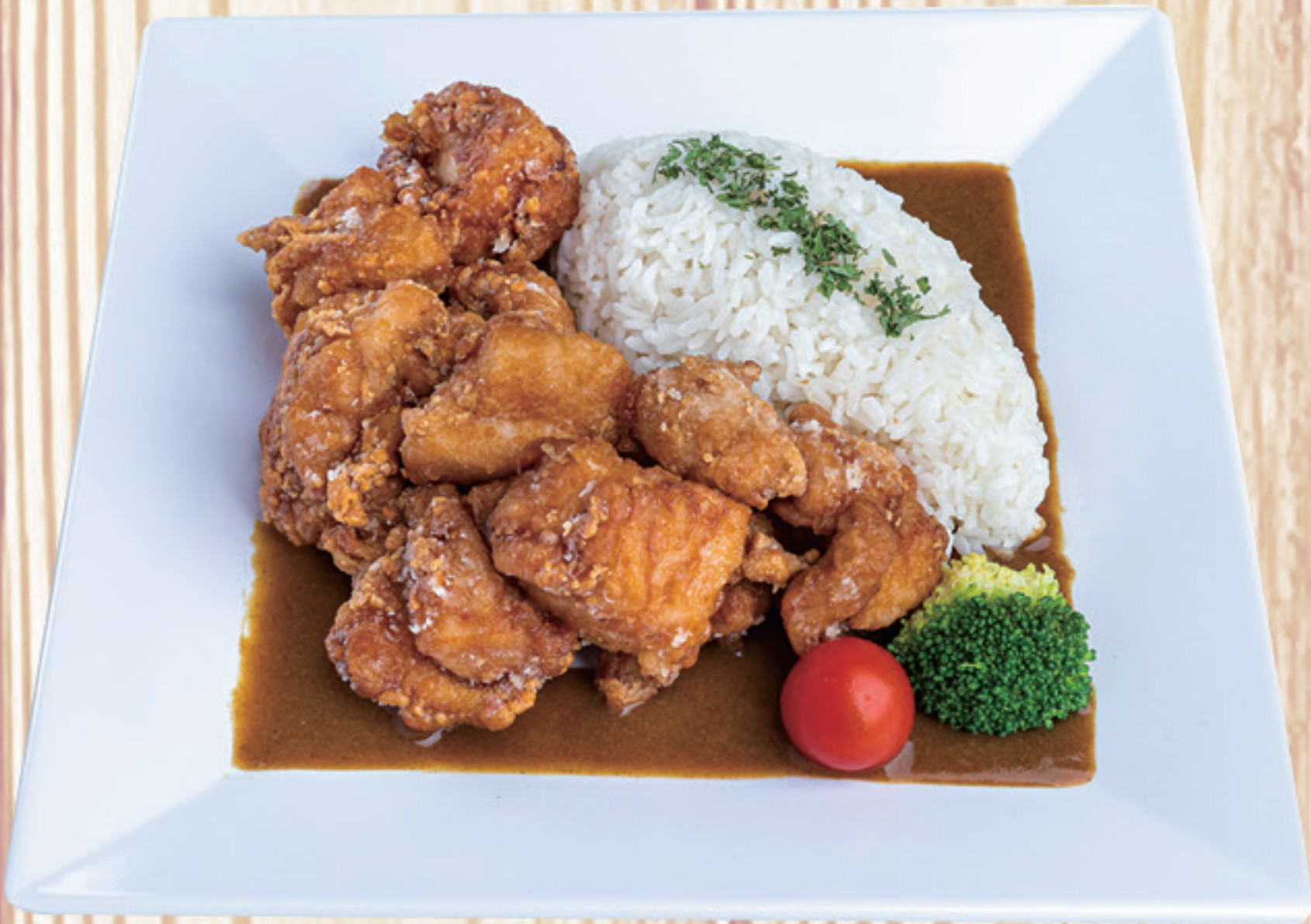
Chicken Karaage Curry $17.75