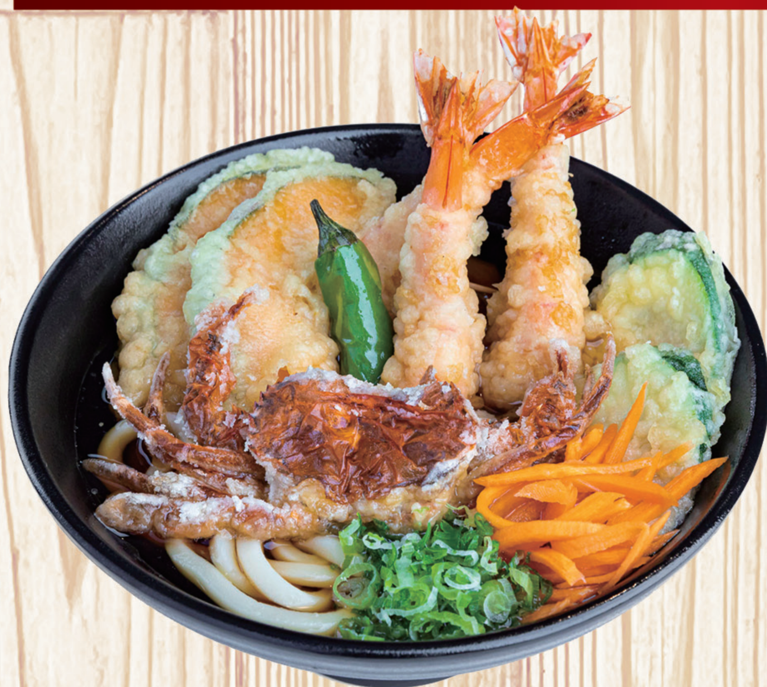
Deluxe Tempura Udon $18.73 Mini Tempura Udon $7.79