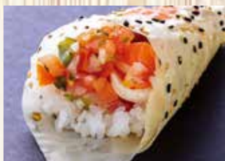
*Sashimi Ceviche Hand Roll