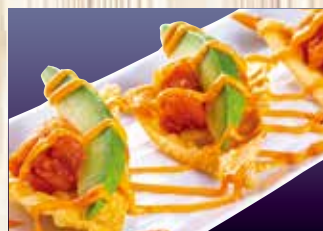
*Spicy Albacore Chips