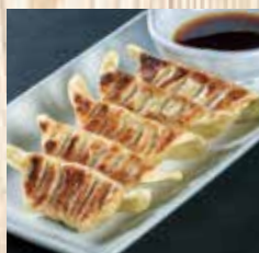
Pan Fried Gyoza