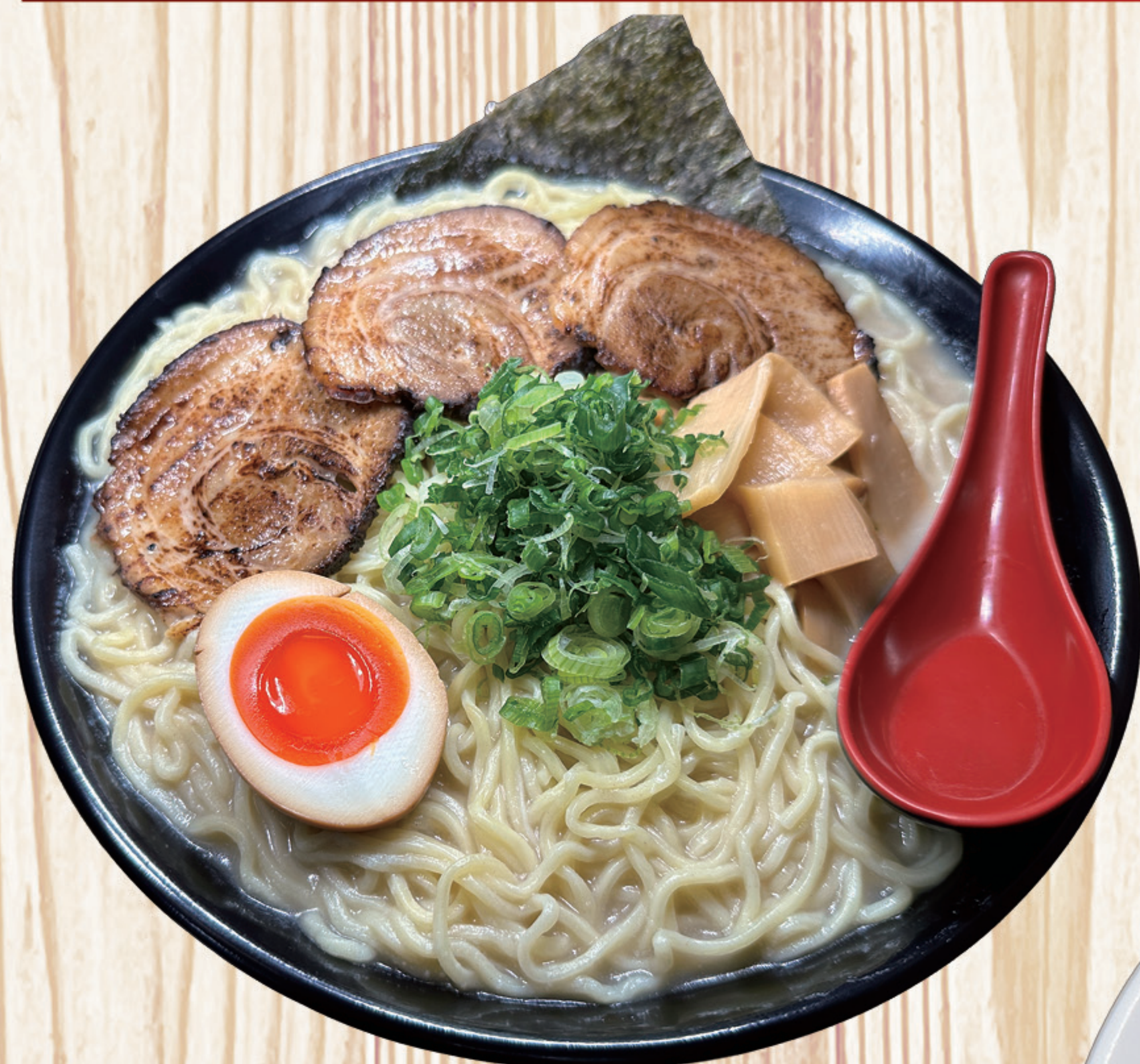
New Tonkotsu Ramen (Pork/Chicken) $15.49