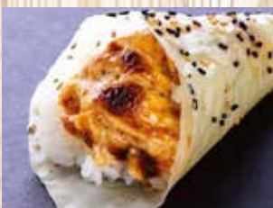
Blue Crab Hand Roll