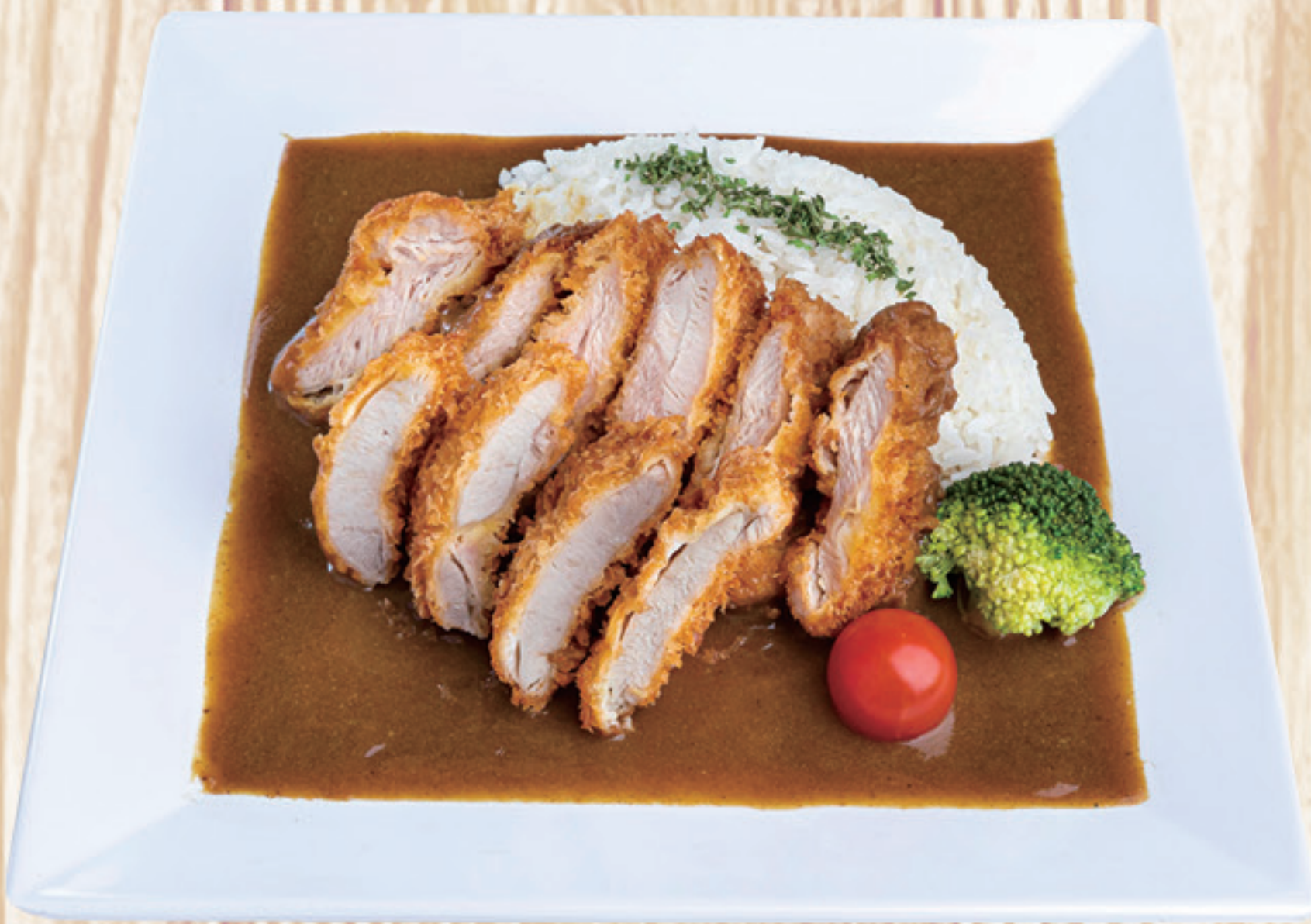
Chicken Cutlet Curry $16.85 Mini Cutlet Curry $6.99