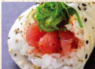
*Tuna Poke Hand Roll