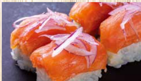
*Philly Salmon Roll