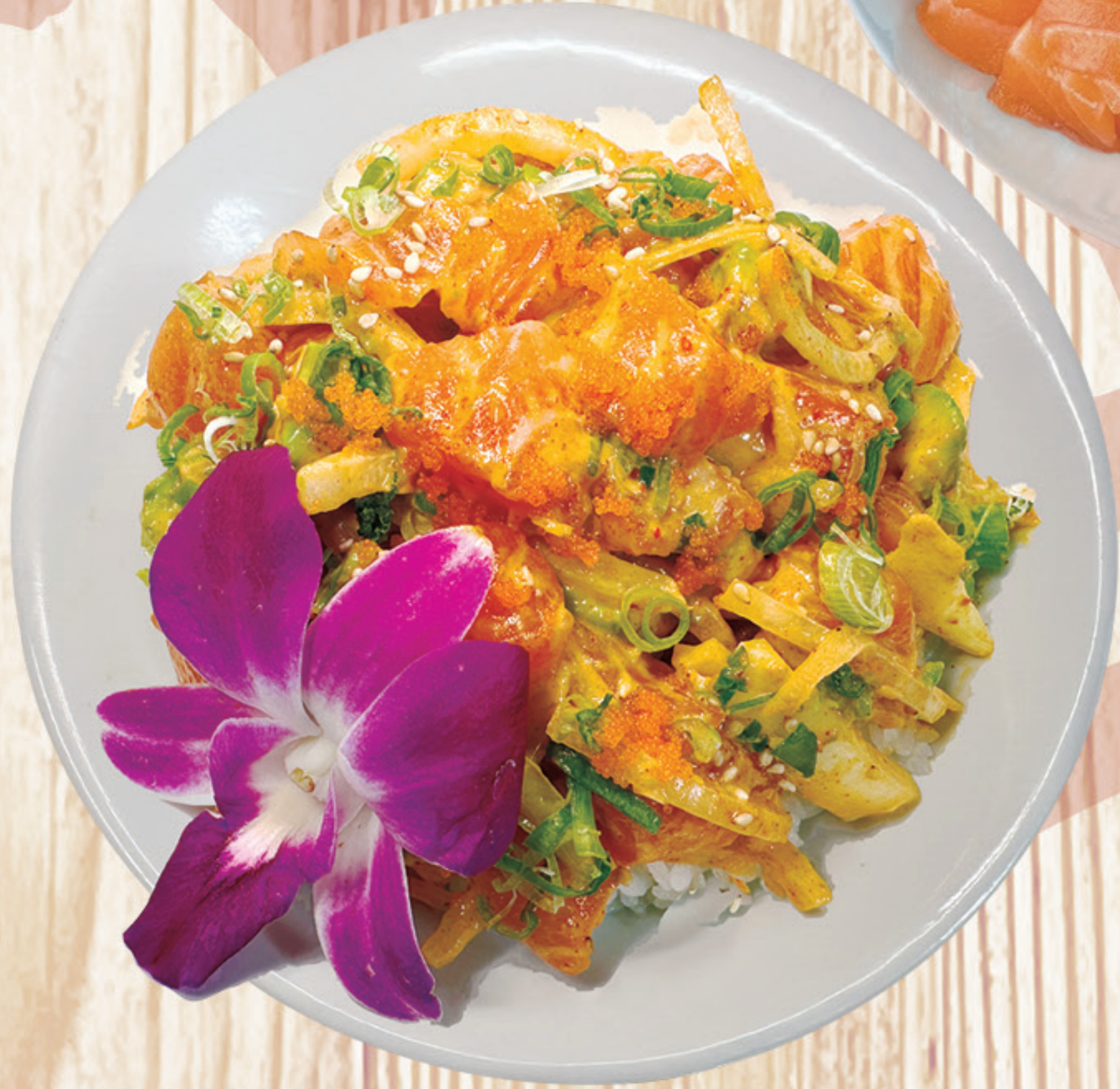
New Spicy Poke Bowl $17.49