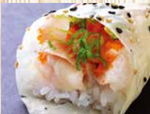
*Yellowtail Truffle Hand Roll