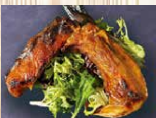
New *Grilled Yellowtail Collar