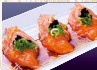
*Salmon Truffle Sauce Sashimi