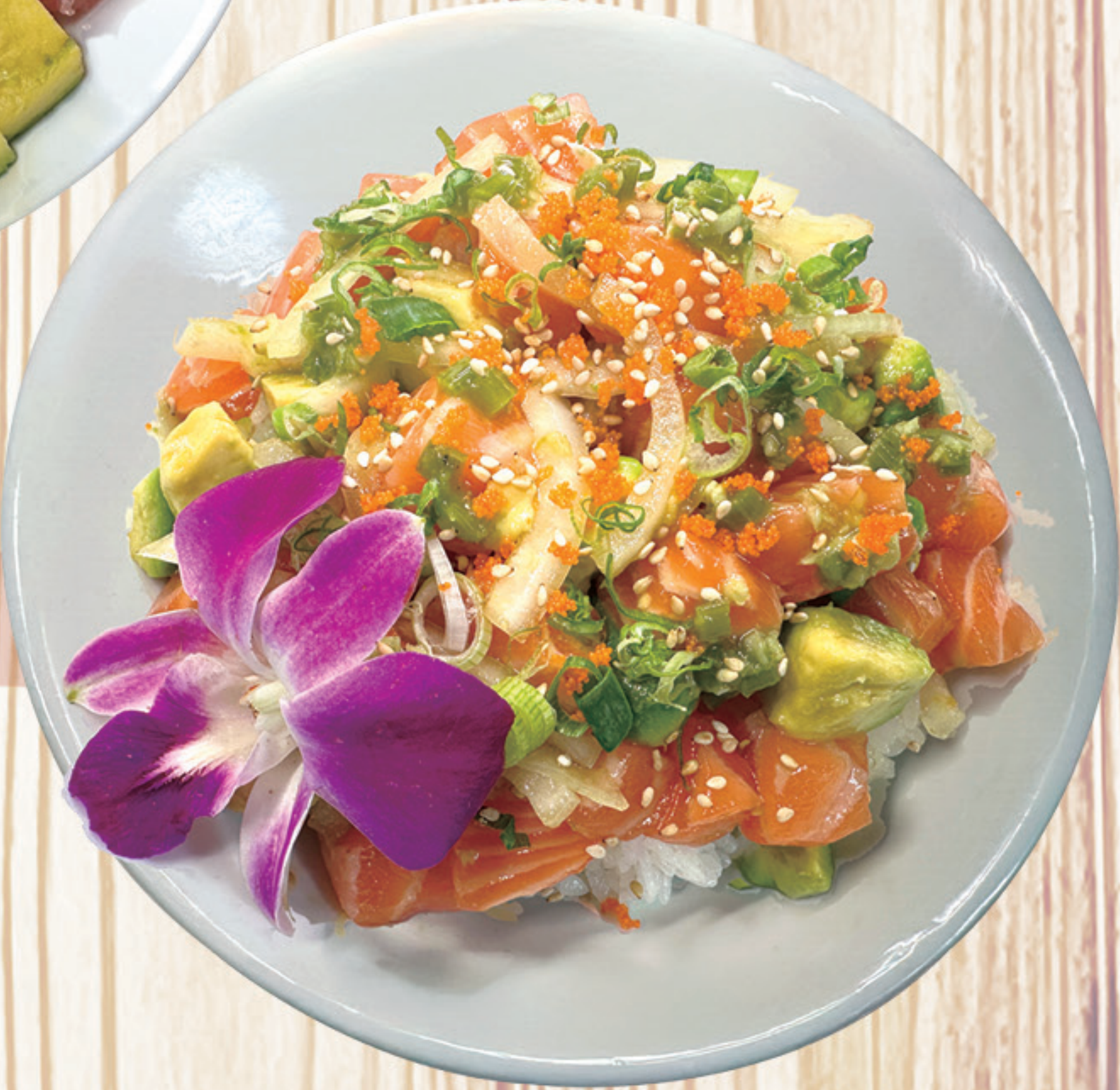
New Wasabi Poke Bowl $17.49