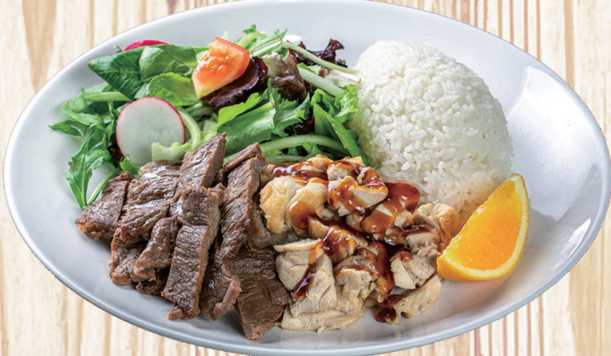
Chicken Beef Plate $18.05