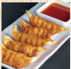
Deep Fried Gyoza