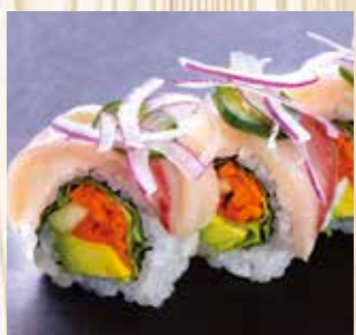
*Veggie Yellowtail Roll Lettuce, carrot, and avocado roll. Topped with yellowtail, raw onion, jalapeno, garlic ponzu, and Sriracha.