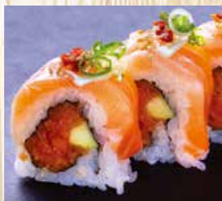
*Lemon Salmon Roll Spicy tuna and cucumber roll. Topped with sliced lemon, green onion, and ponzu sauce.