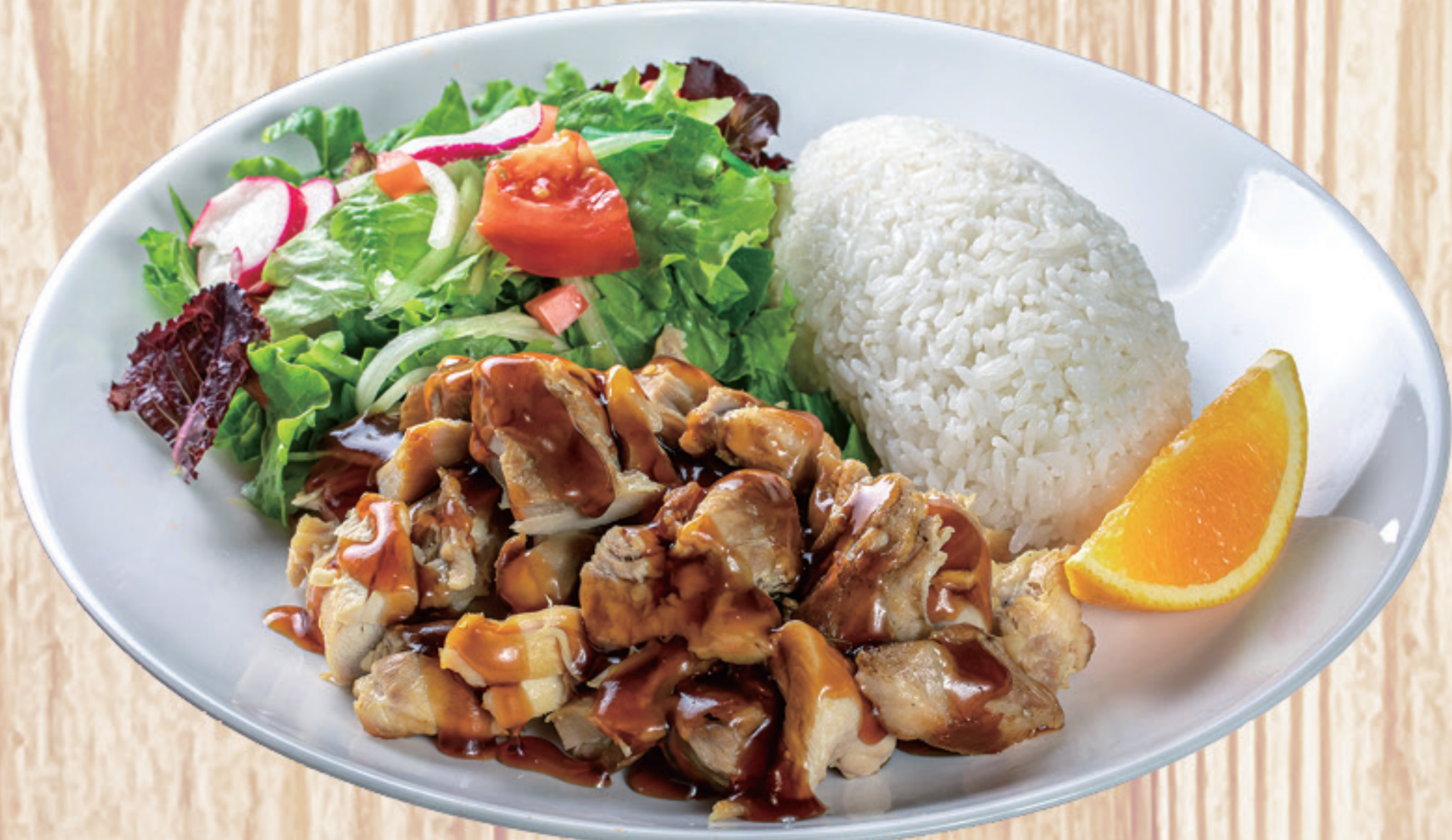
Chicken Teriyaki Plate $17.21 Mini Chicken Bowl $7.15