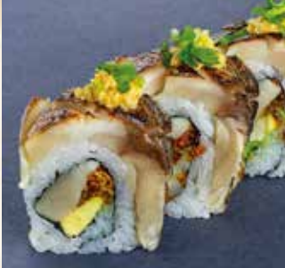
*Aburi Shimesaba Roll Japanese Mackerel, fried onion, avocado, and ginger roll topped with Seared Japanese Mackerel, ginger, and green onion.