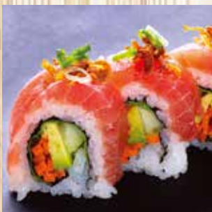
*Veggie Tuna Roll Lettuce, cucumber, carrot, and avocado roll. Topped with tuna, fried onion, and garlic ponzu.