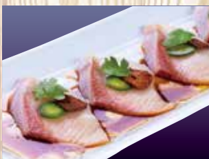
*Yellowtail Jalapeno Sashimi