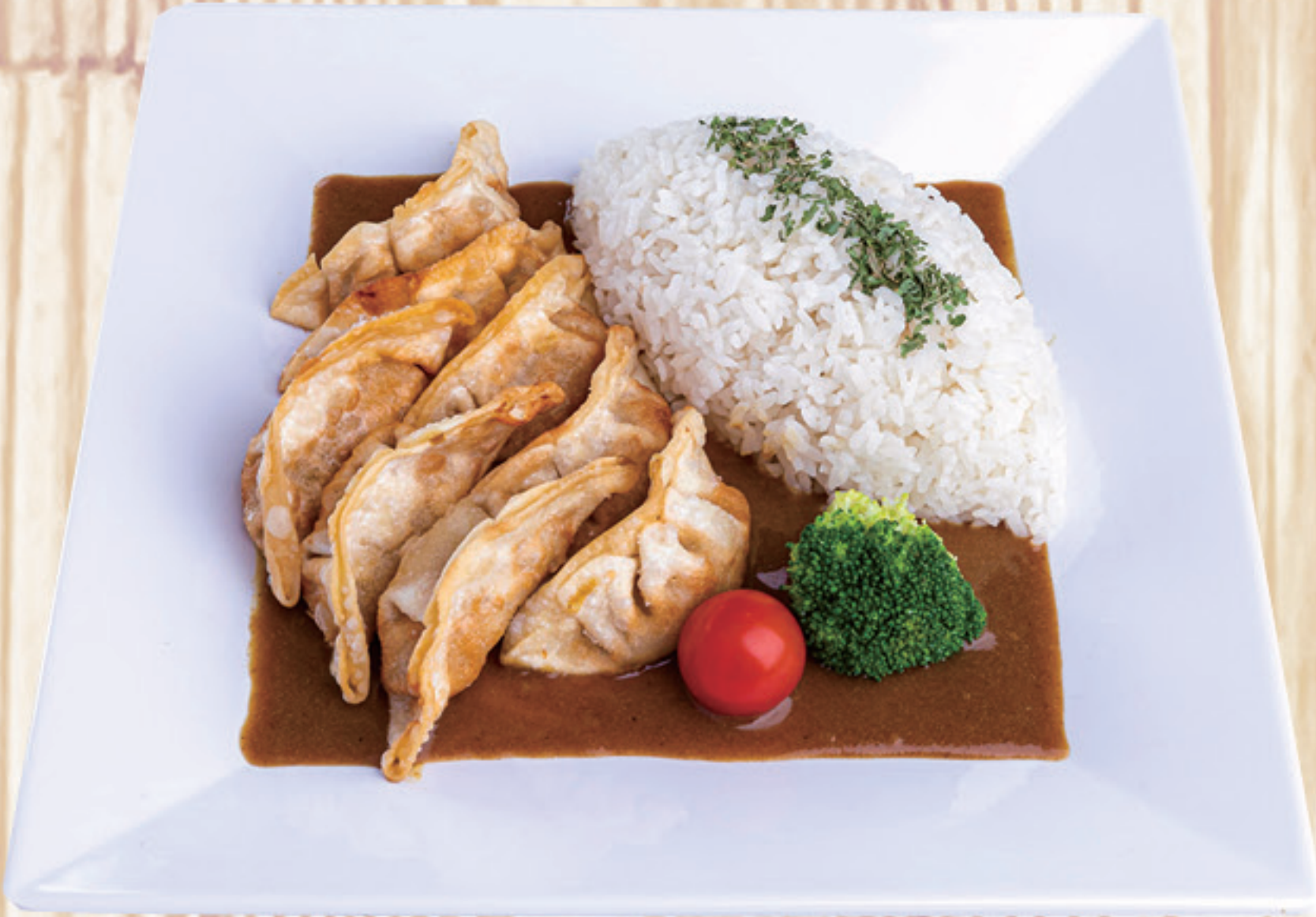
Chicken Gyoza Curry $15.77