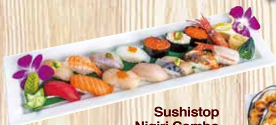
Sushistop Nigiri Combo