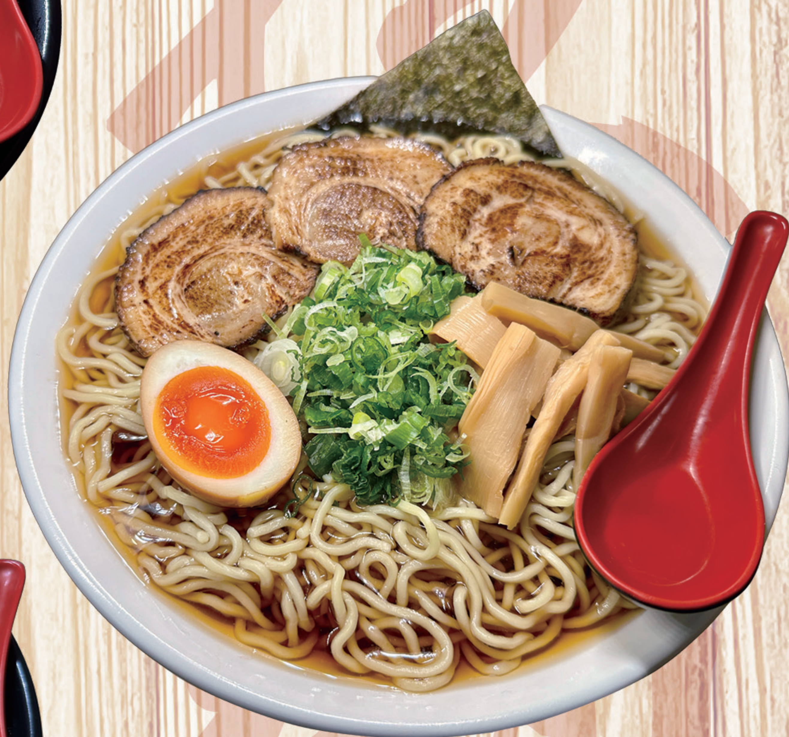
New Shoyu Ramen (Pork/Chicken) $15.49