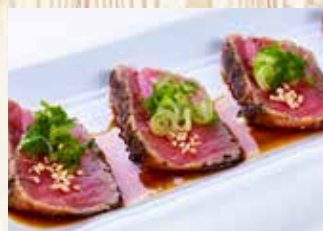
New *Pepper Tuna Sashimi