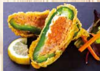
*Tempura Cheese Jalapeno