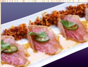
*Albacore Miso Sauce Sashimi