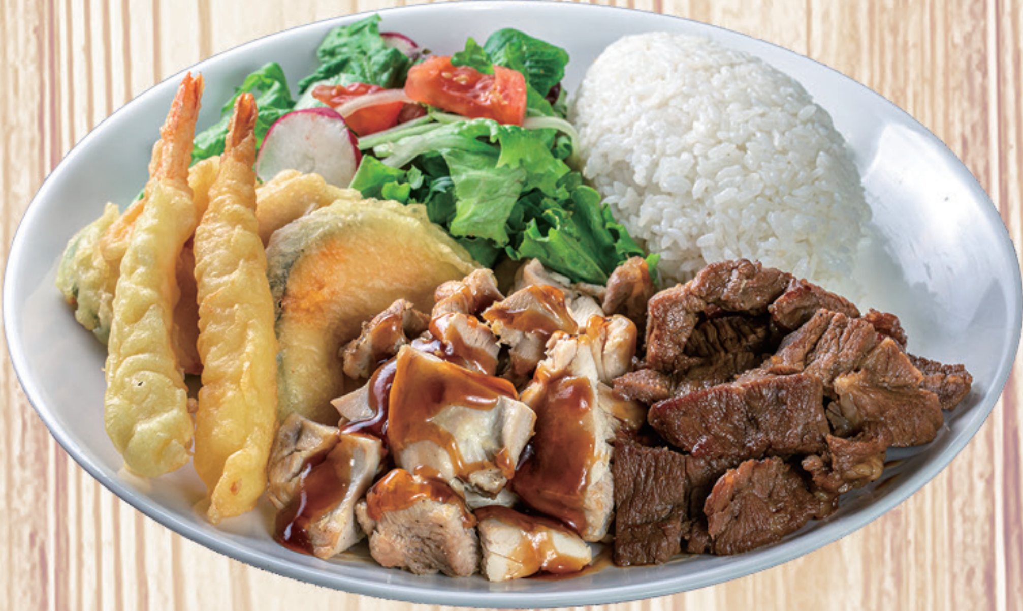
Chicken Tempura Beef Plate $20.25