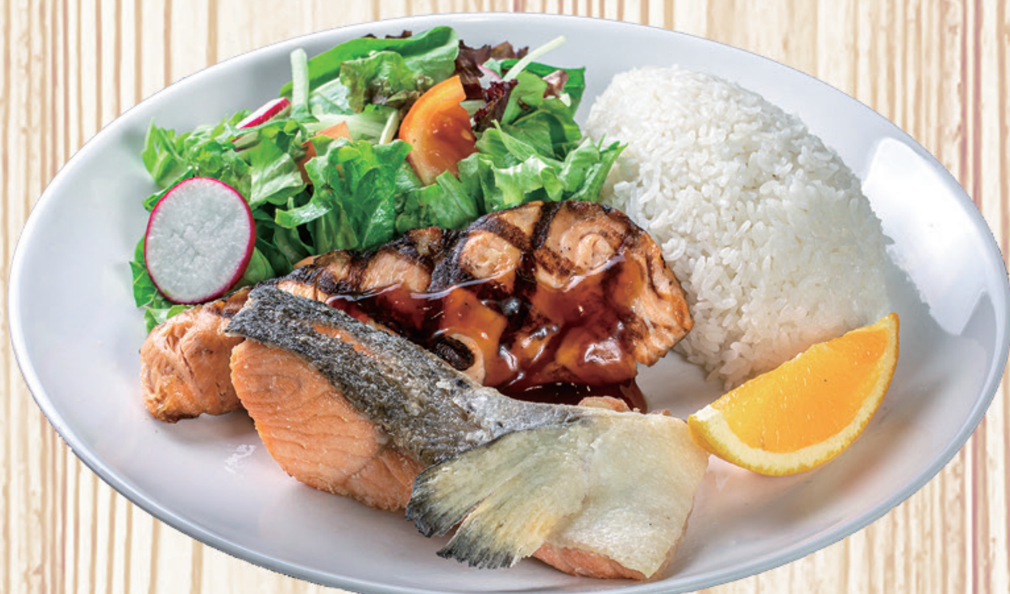
Salmon Teriyaki Plate $20.49