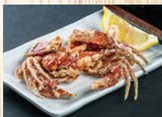
Soft Shell Crab