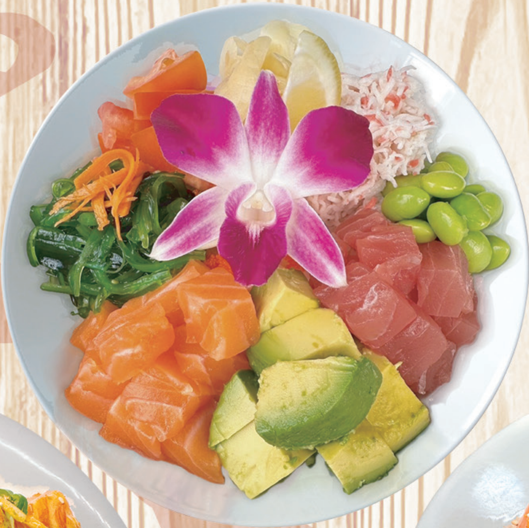
New Original Poke Bowl $17.49