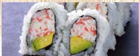
*Salmon Avocado Roll California Roll *Spicy Tuna Roll Eel Avocado Roll *Spicy Scallop Roll