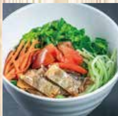
Salmon Skin Salad