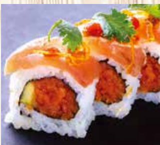
*Yuzu Albacore Roll Spicy tuna and cucumber roll. Topped with Sriracha, cilantro, fried onion, and garlic ponzu.