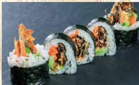
Salmon Skin Roll Crispy salmon skin, avocado, carrot, cucumber.