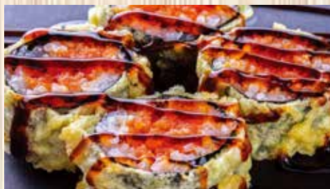
*Spicy Tuna Tempura Roll

*Raw Fish CONSUMER ADVISORY: Items marked with an asterisk may be served raw or undercooked meats, poultry, seafood, shellfish, or eggs, which may increase your risk of foodborne illness, especially if you have certain medical conditions.