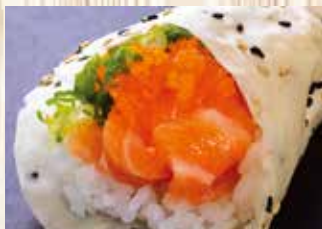
*Salmon Truffle Hand Roll