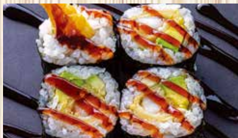
Shrimp Tempura Roll