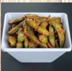
Spicy Garlic Edamame