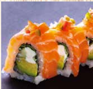
*Veggie Salmon Ceviche Roll Lettuce, avocado, cucumber, and cream cheese roll. Topped with salmon and ceviche sauce.