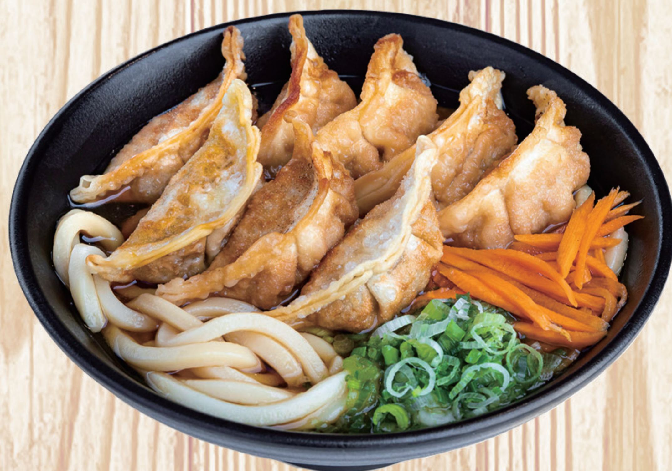
Chicken Gyoza Udon $16.81