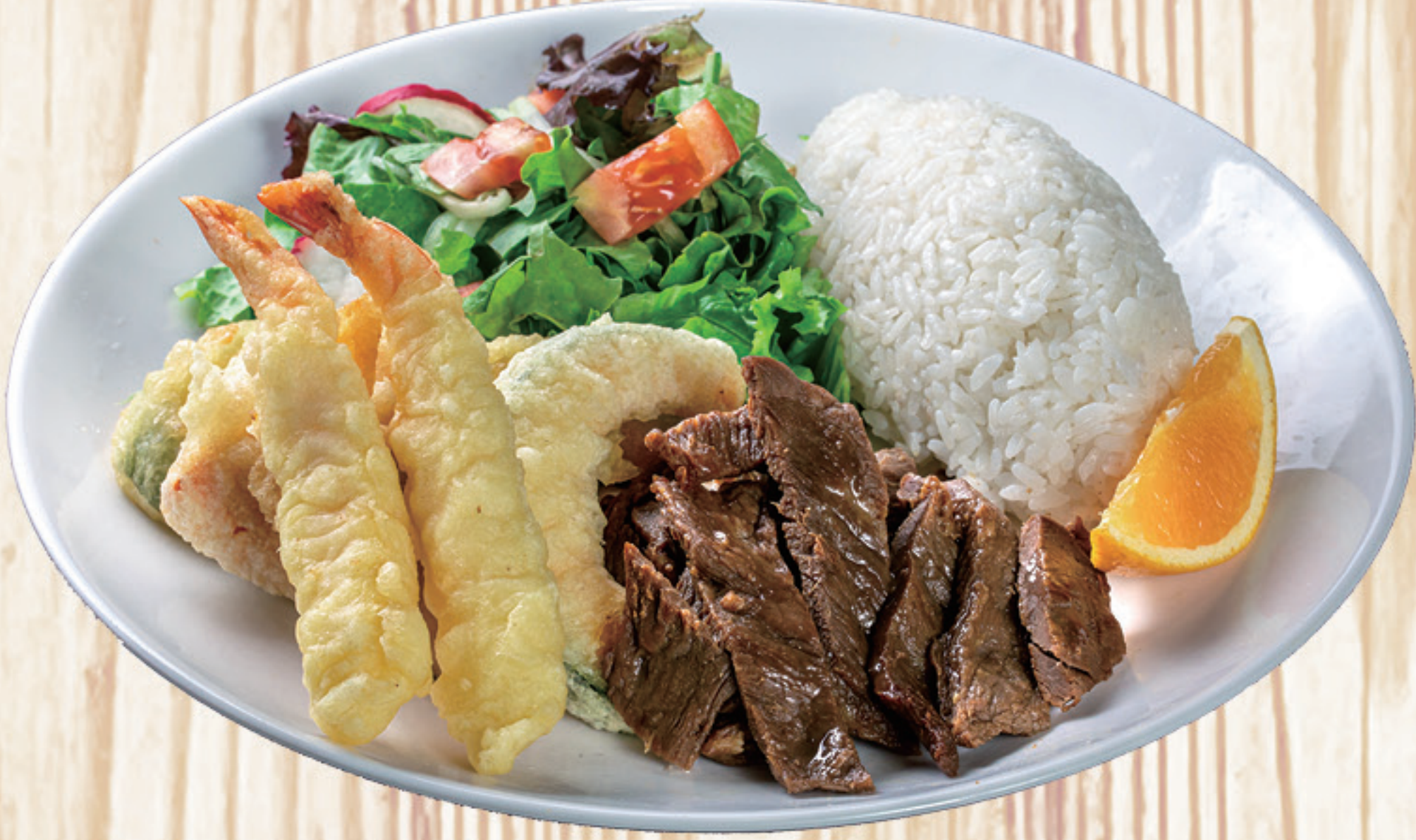
Beef Tempura Plate $17.57