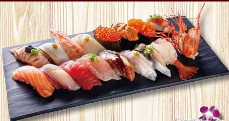
New Special Nigiri Combo