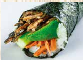
Salmon Skin Hand Roll