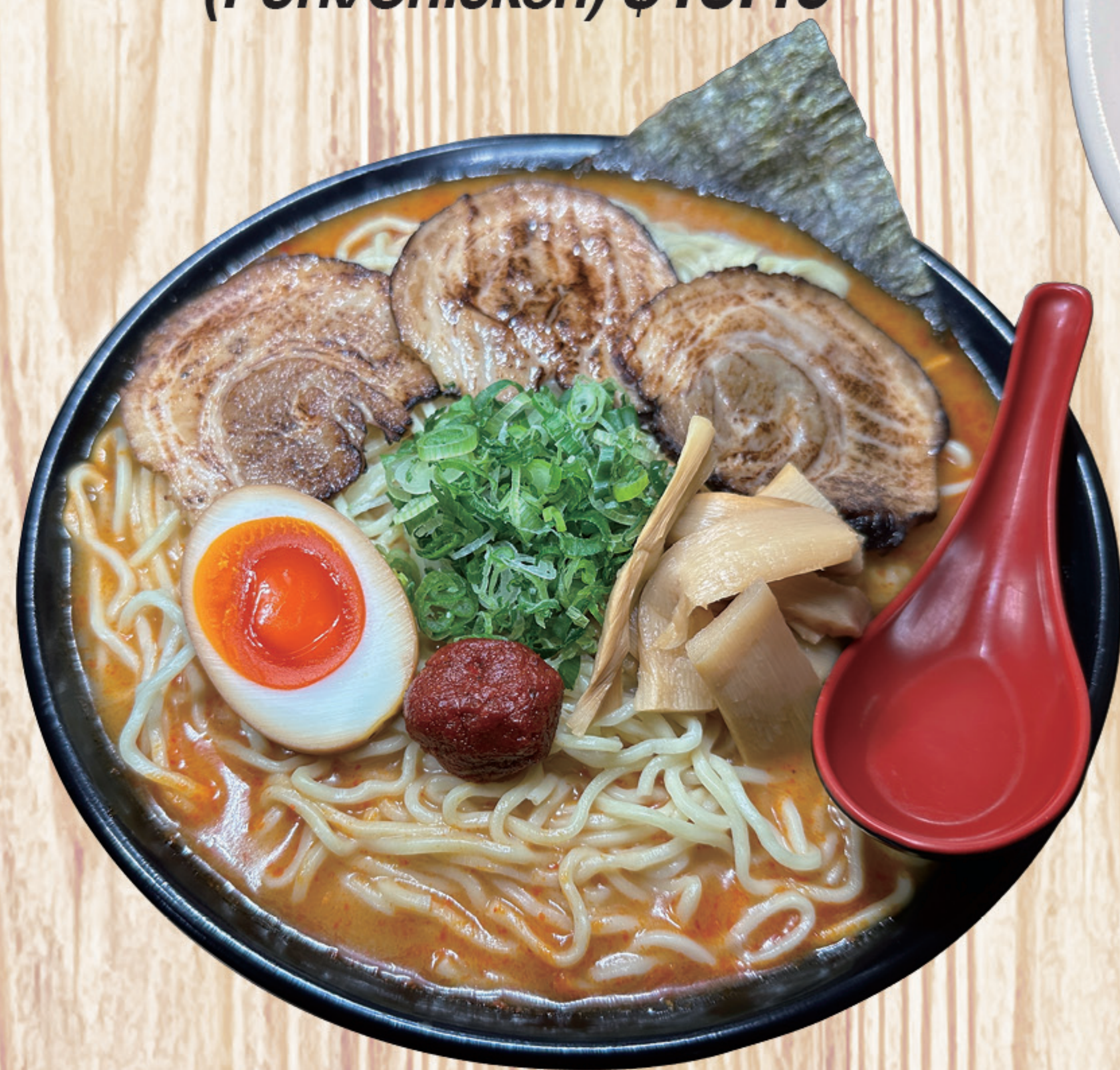
New Spicy Ramen (Pork/Chicken) $16.99