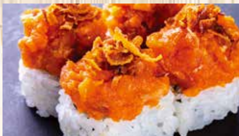
*Spicy Albacore Roll