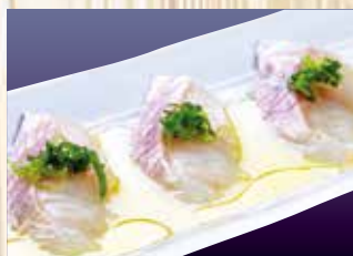
*Snapper Yuzu Sauce Sashimi