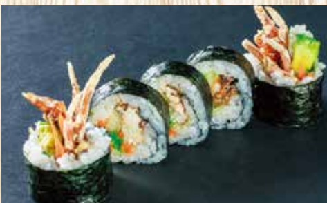
Spider Roll Deep fried soft shell crab, avocado, carrot, cucumber.