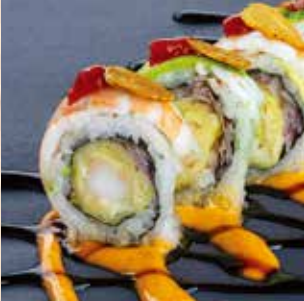
Double Shrimp Roll Shrimp Tempura, Avocado, and Red Onion roll topped with Shrimp, spicy mayo, eel sauce, sriracha, and garlic chips.