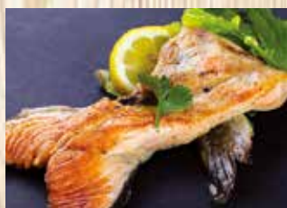
*Grilled Salmon Collar