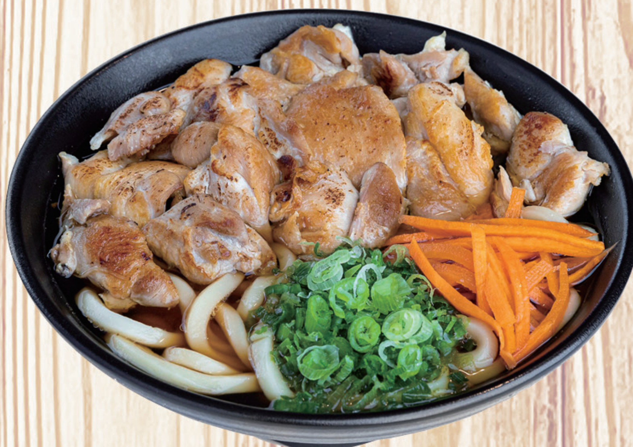
Chicken Grilled Udon $17.77