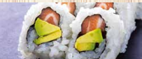
Avocado Roll Cucumber Roll Avocado Cucumber Roll Vegetable Roll

*Raw Fish CONSUMER ADVISORY: Items marked with an asterisk may be served raw or undercooked meats, poultry, seafood, shellfish, or eggs, which may increase your risk of foodborne illness, especially if you have certain medical conditions.