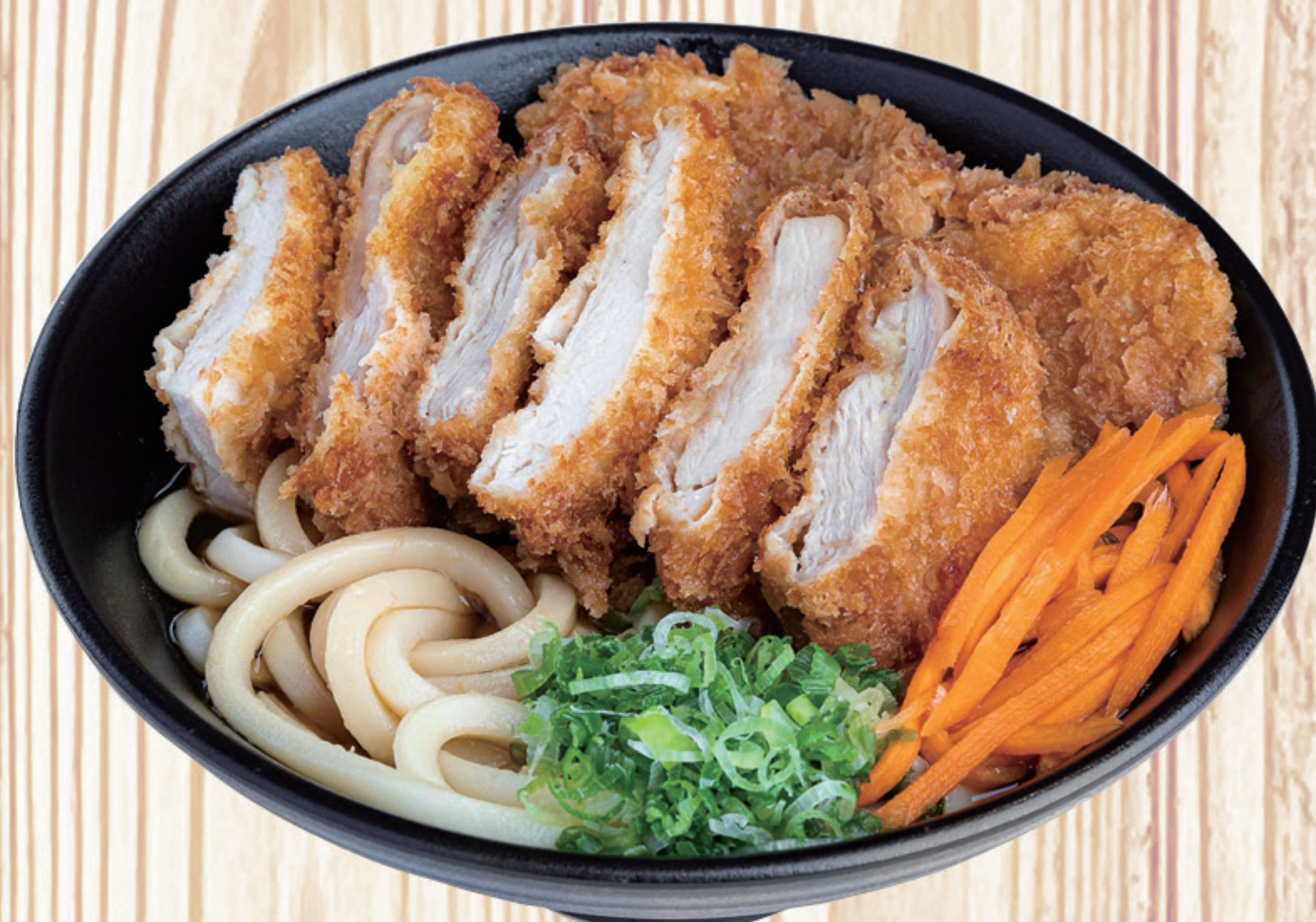
Chicken Cutlet Udon $17.79