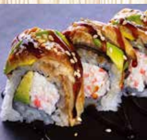
Dragon Roll California roll. Topped with eel, avocado, eel sauce, and sesame seeds.