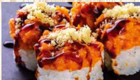
*Spicy Salmon Roll