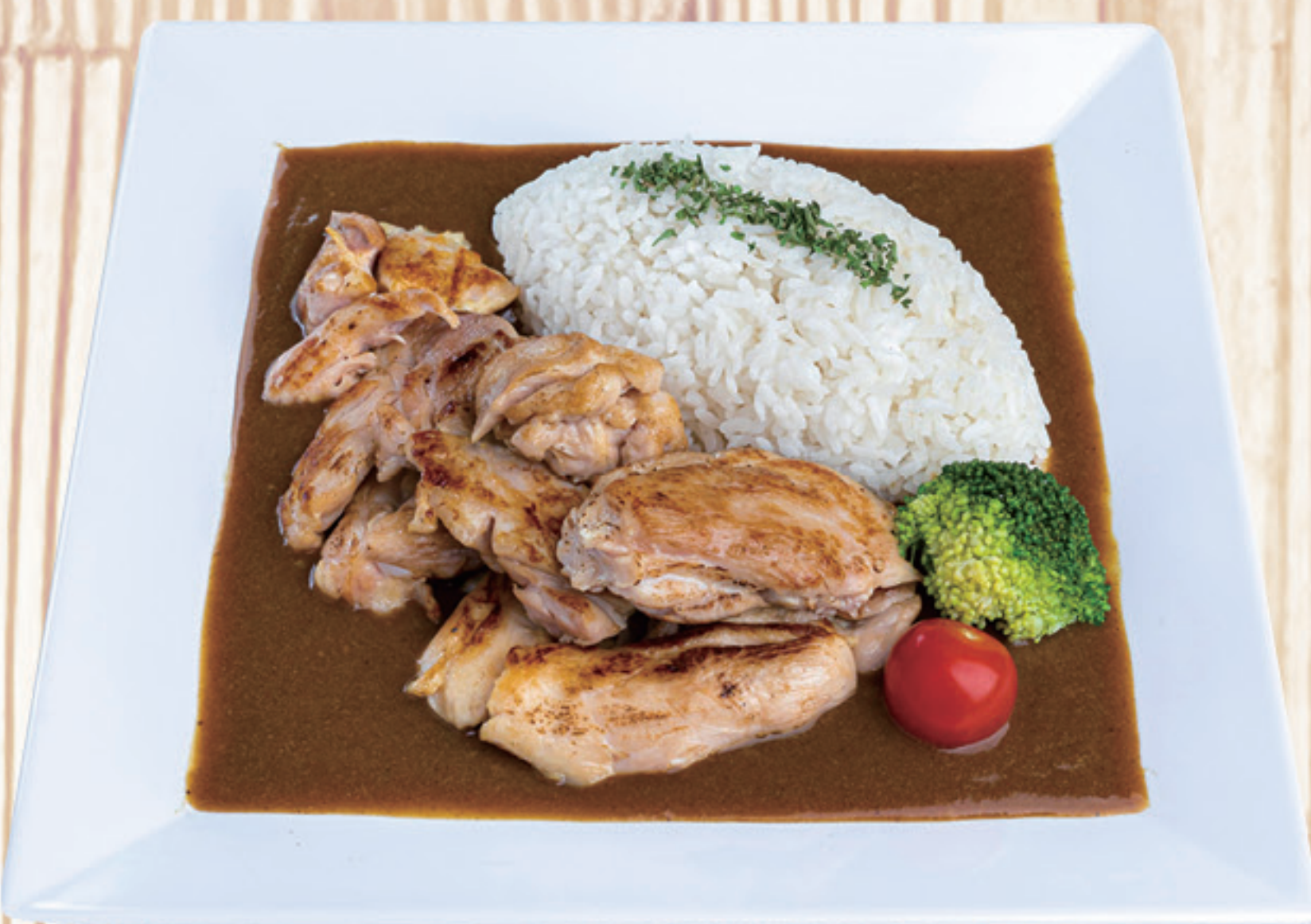
Chicken Grilled Curry $16.87