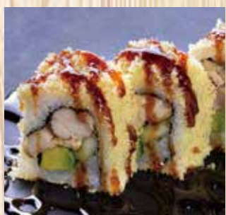
Chicken Crunchy Roll Chicken, avocado, cucumber, cream cheese, and Sriracha roll. Topped with crunchy flakes and teriyaki sauce.