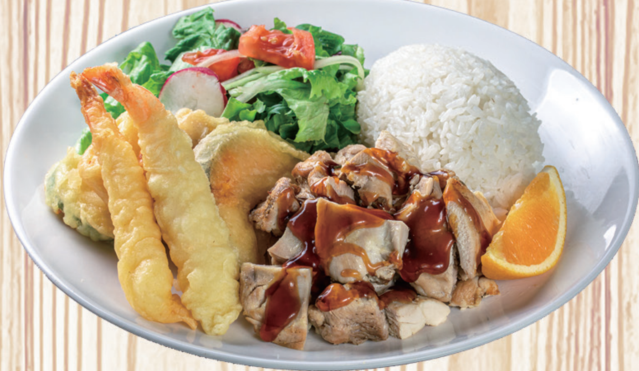
Chicken Tempura Plate $16.81