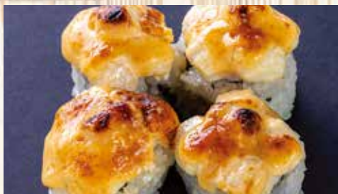
*Dynamite Bay Scallop Roll