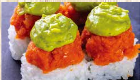
*Spicy Tuna Guacamole Roll