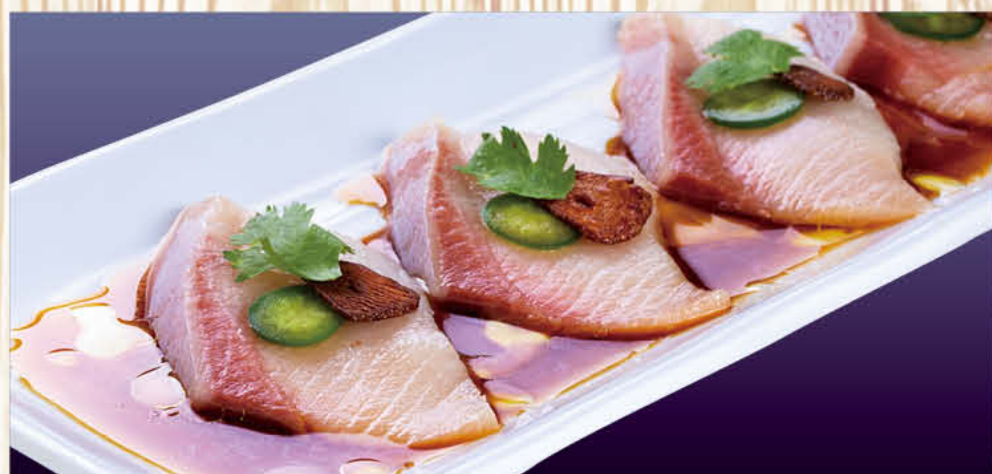
*Yellowtail Jalapeno Sashimi $10.73