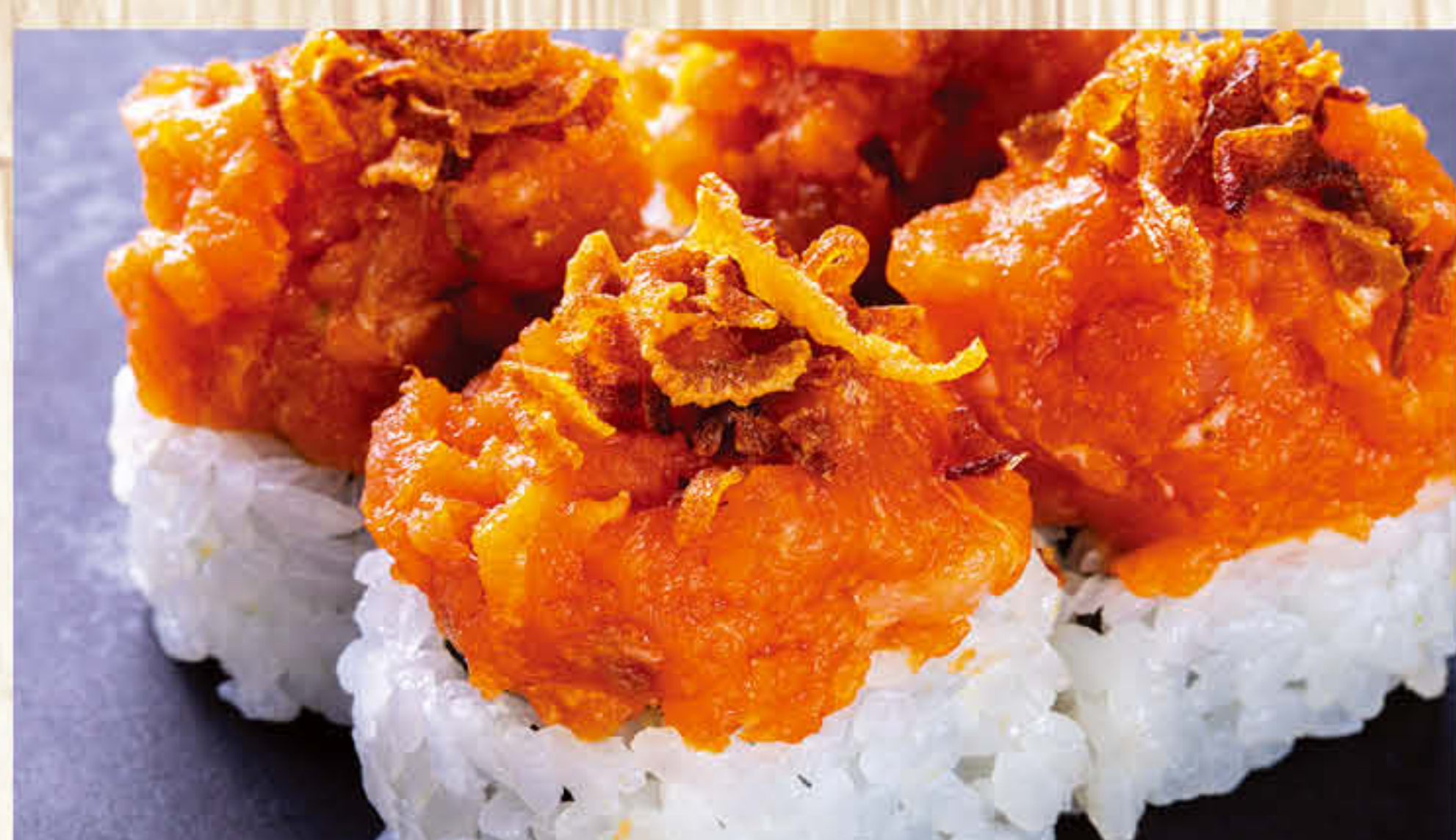
*Spicy Albacore Roll $4.89