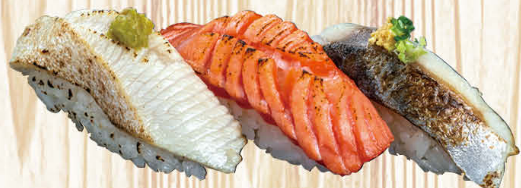
*Aburi Trio Sushi $7.03