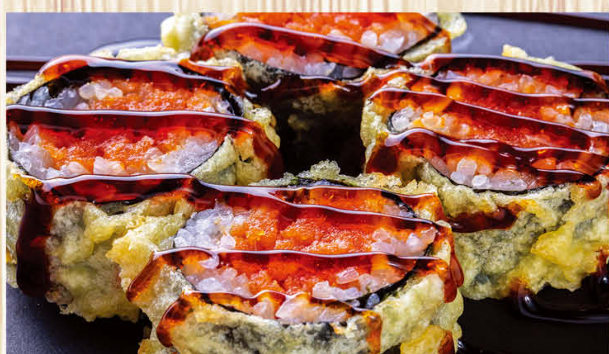
*Spicy Tuna Tempura Roll $5.95

*Raw Fish CONSUMER ADVISORY: Items marked with an asterisk may be served raw or undercooked meats, poultry, seafood, shellfish, or eggs, which may increase your risk of foodborne illness, especially if you have certain medical conditions.