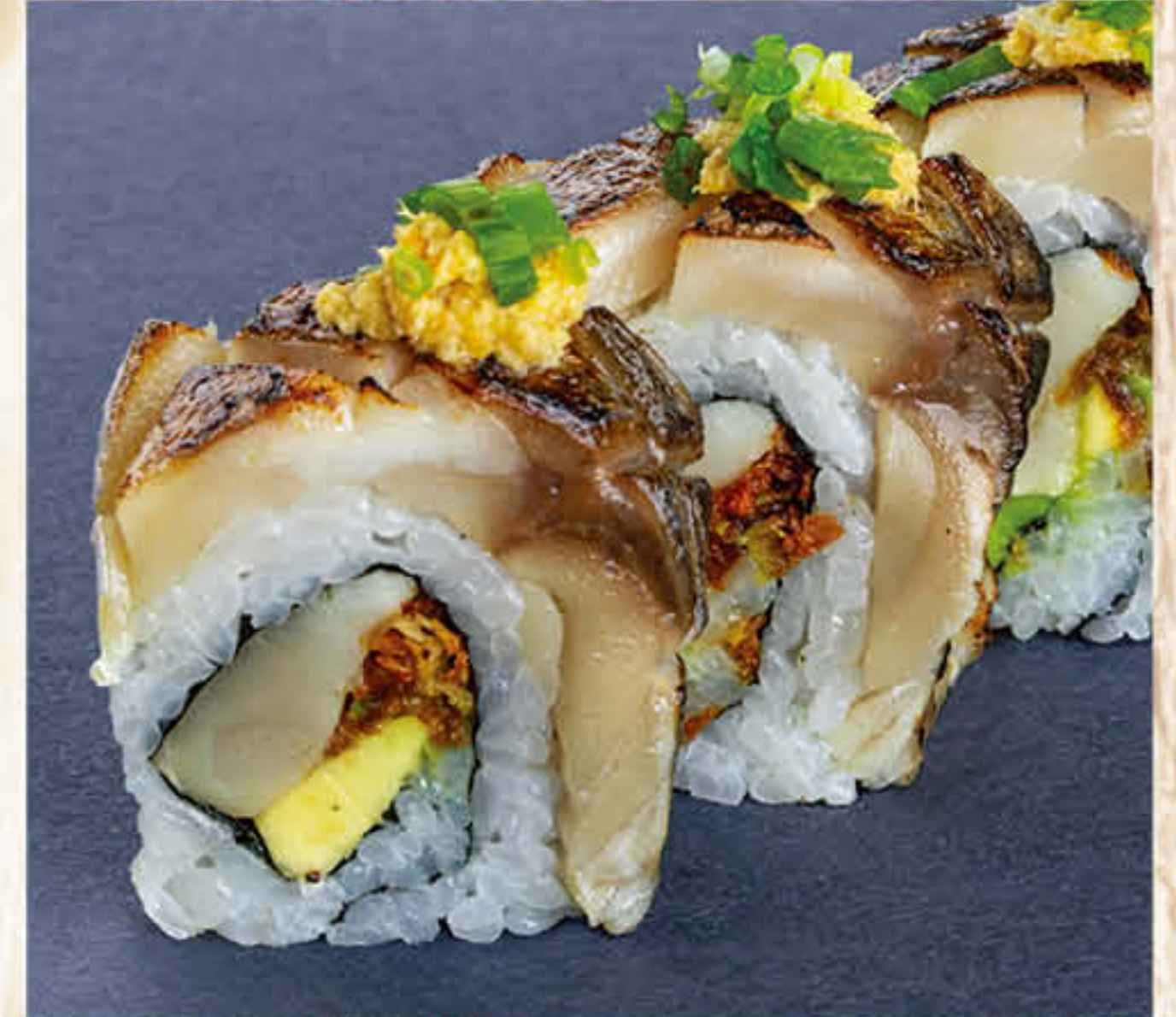
*Aburi Shimesaba Roll $7.91 Japanese Mackerel, fried onion, avocado, and ginger roll topped with Seared Japanese Mackerel, ginger, and green onion.