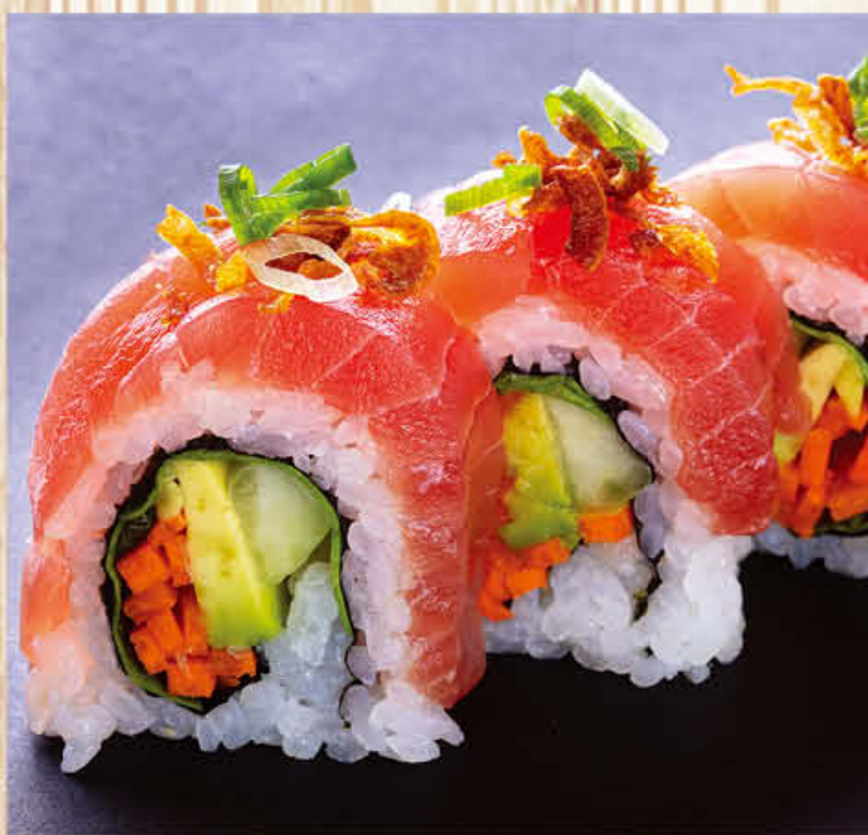
*Veggie Tuna Roll $8.63 Lettuce, cucumber, carrot, and avocado roll. Topped with tuna, fried onion, and garlic ponzu.