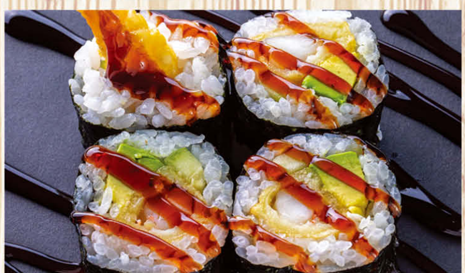
Shrimp Tempura Roll $5.73