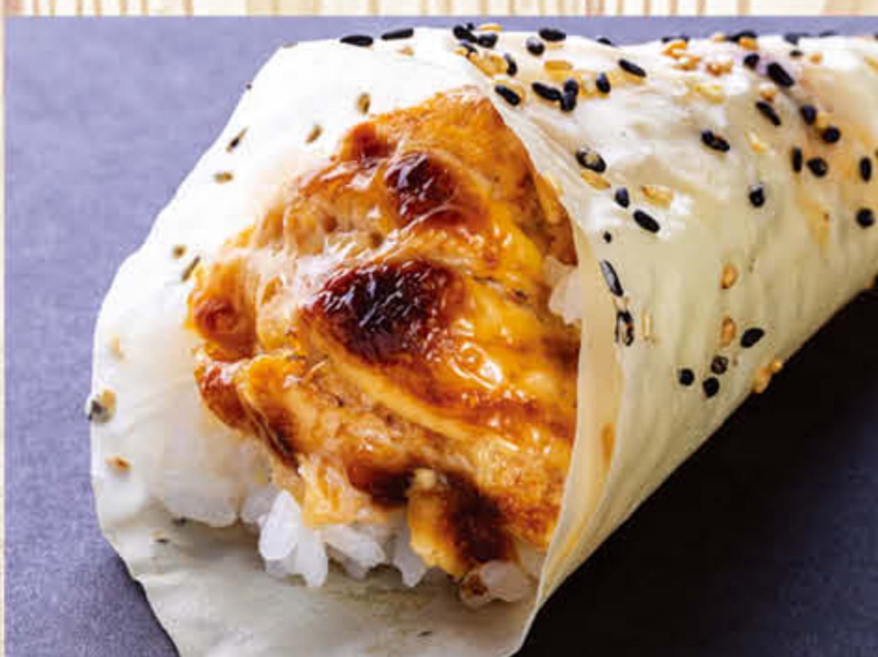
Blue Crab Hand Roll $5.95