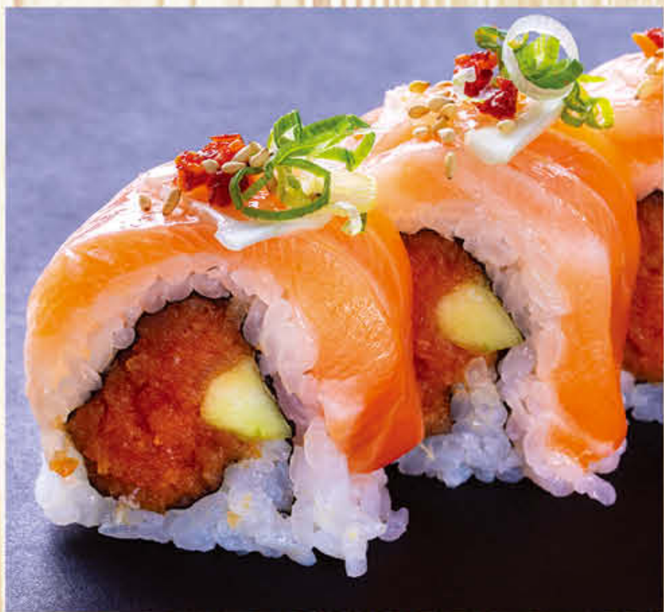
*Lemon Salmon Roll $8.95 Spicy tuna and cucumber roll. Topped with sliced lemon, green onion, and ponzu sauce.