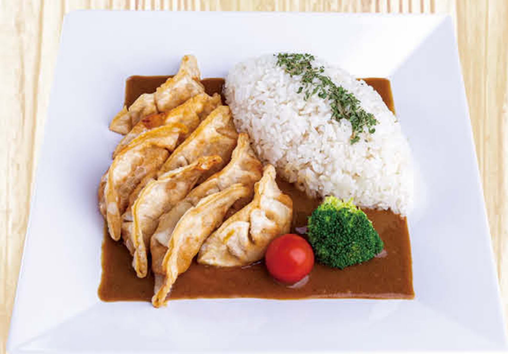
Chicken Gyoza Curry $15.21