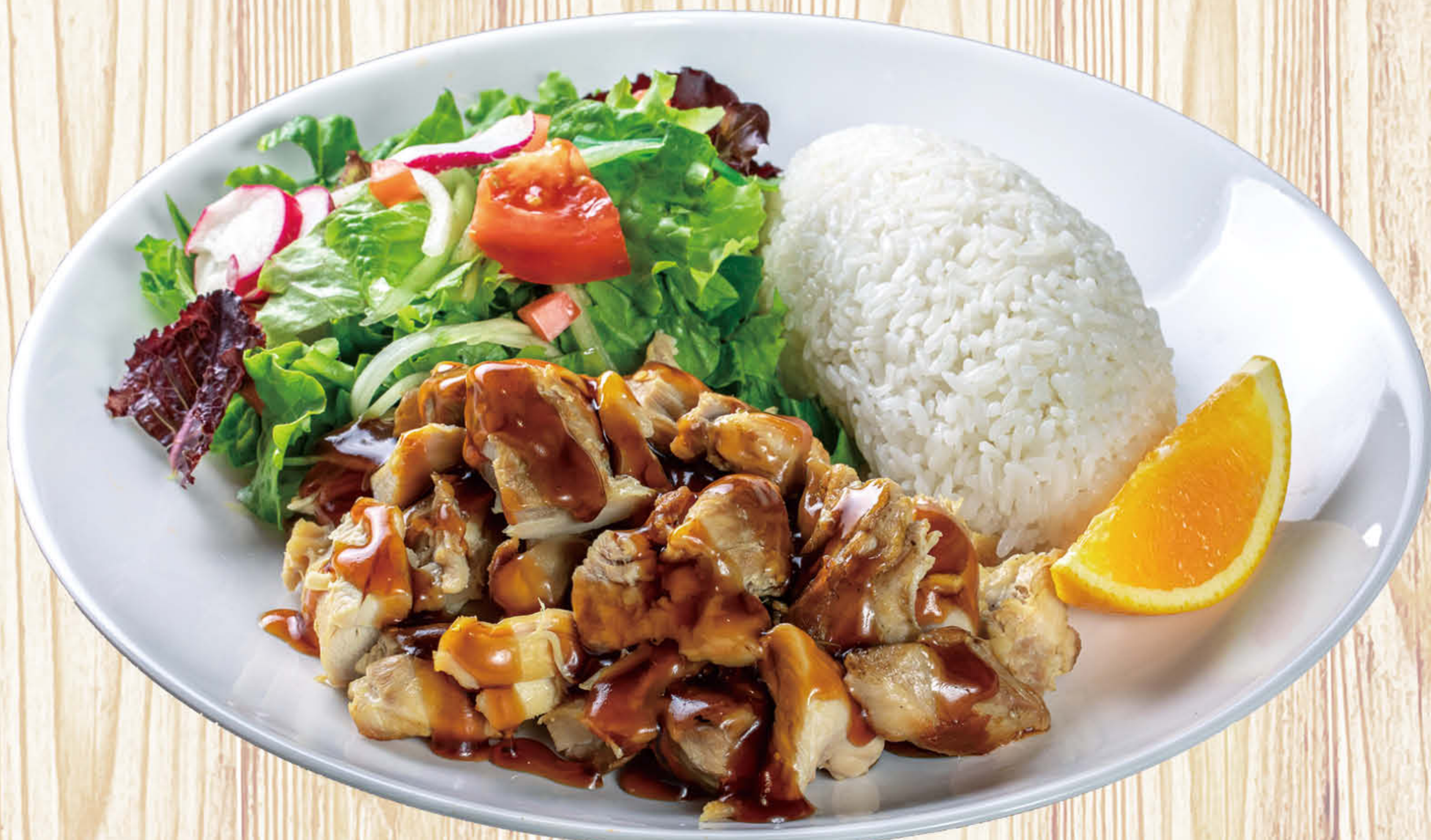
Chicken Teriyaki Plate $16.61 Mini Chicken Bowl $6.63