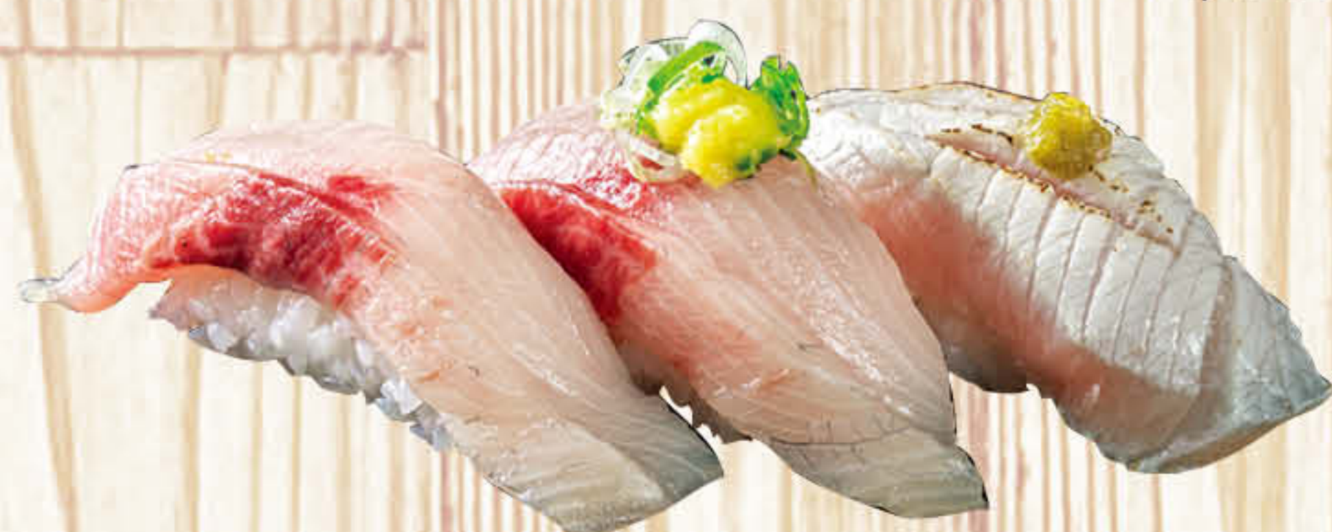
*Yellowtail Sampler Sushi $8.19