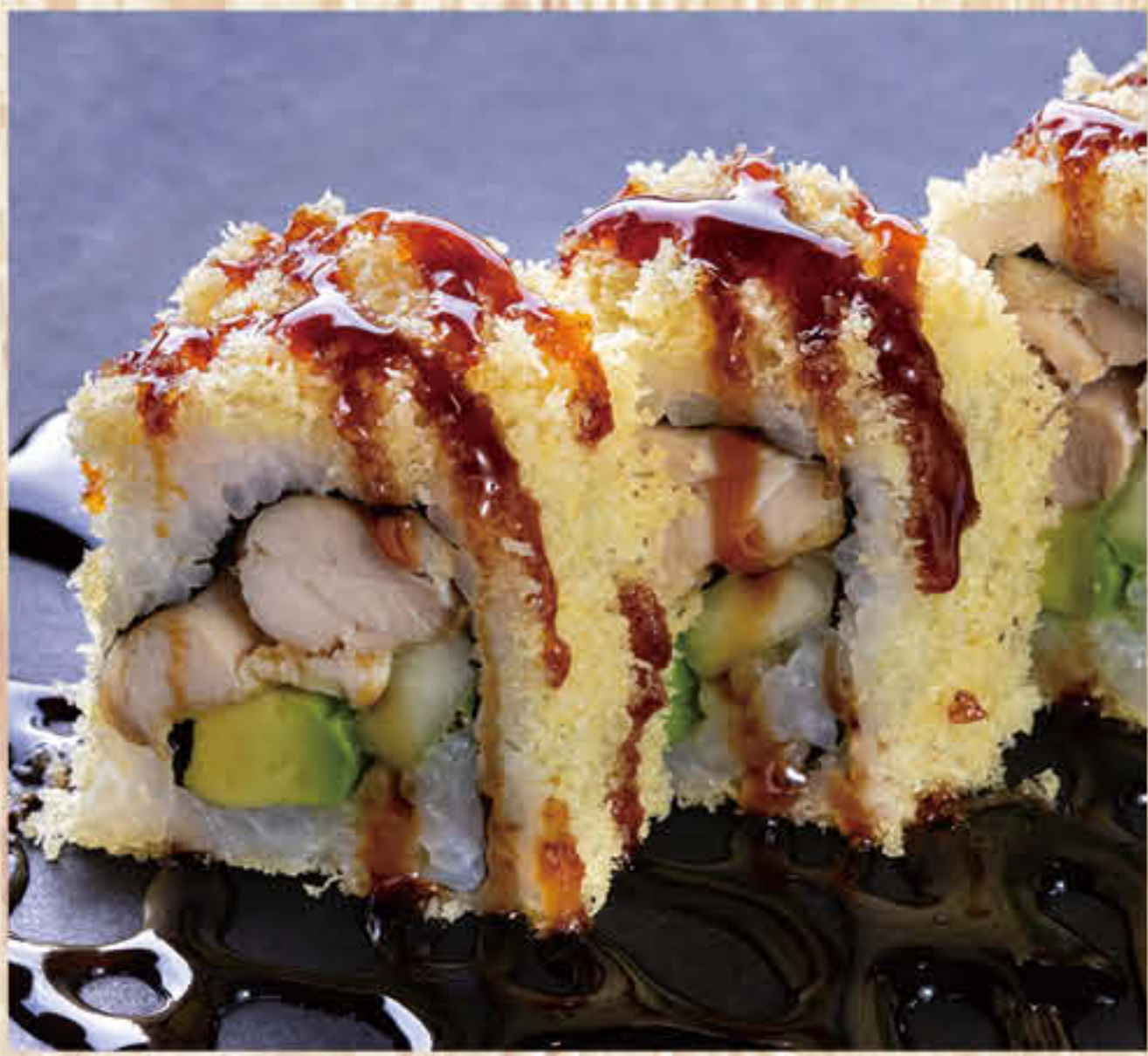
Chicken Crunchy Roll $7.91 Chicken, avocado, cucumber, cream cheese, and Sriracha roll. Topped with crunchy flakes and teriyaki sauce.