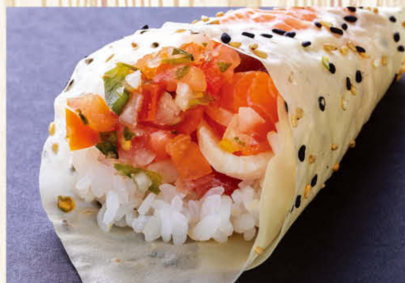
*Sashimi Ceviche Hand Roll $5.57