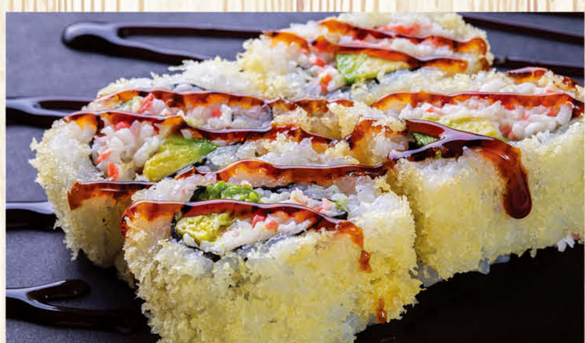
Crunchy California Roll $5.73