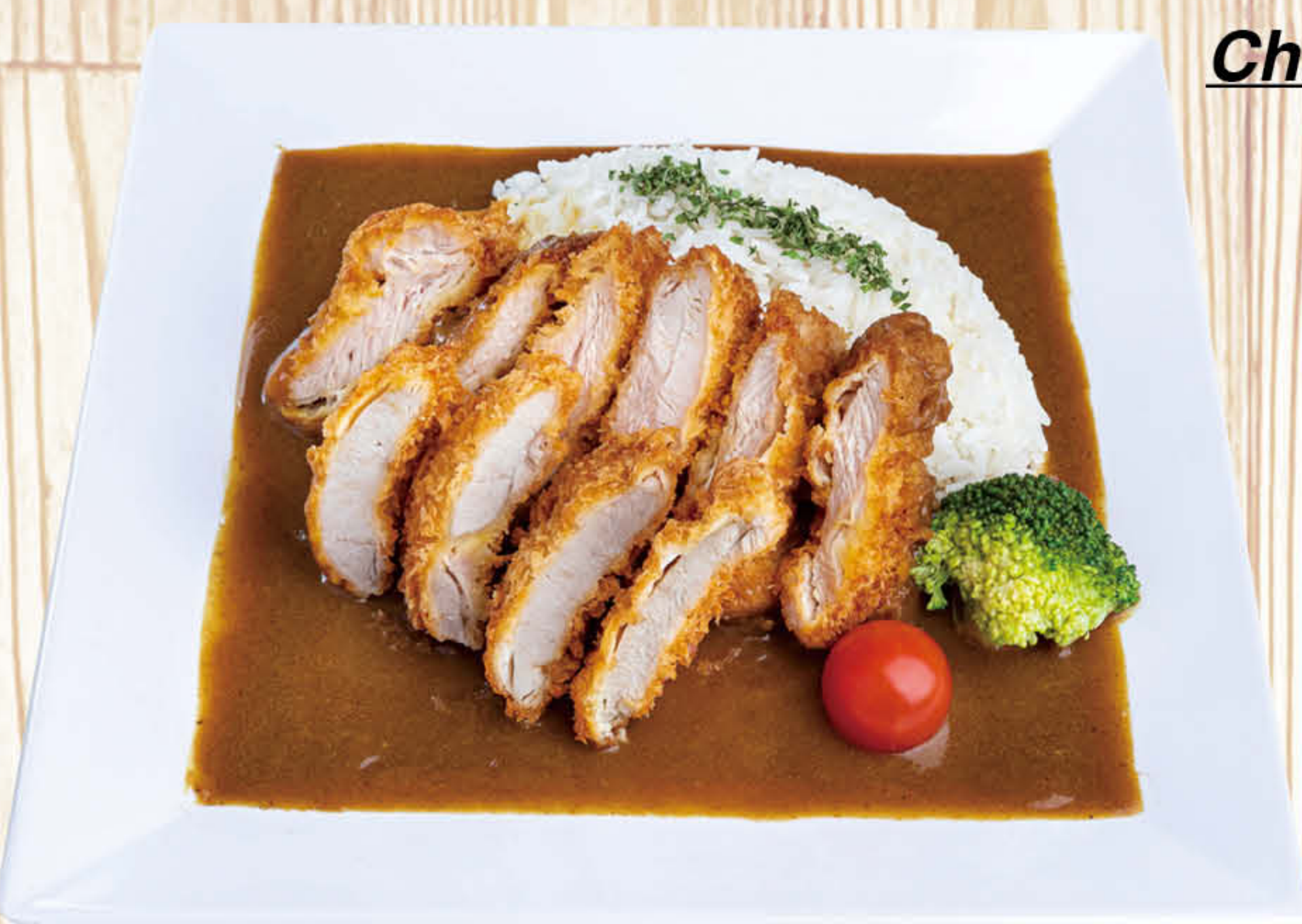
Chicken Cutlet Curry $16.25 Mini Cutlet Curry $6.49