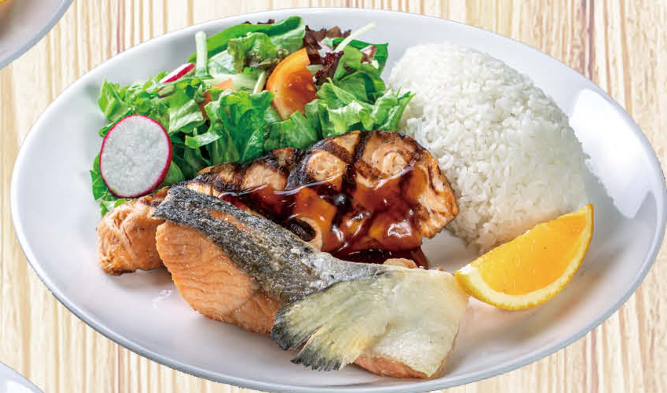
Salmon Teriyaki Plate $19.79