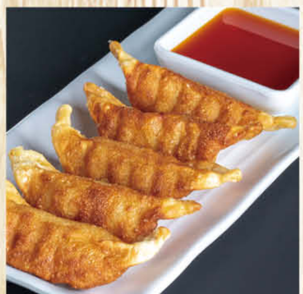
Deep Fried Gyoza $5.53