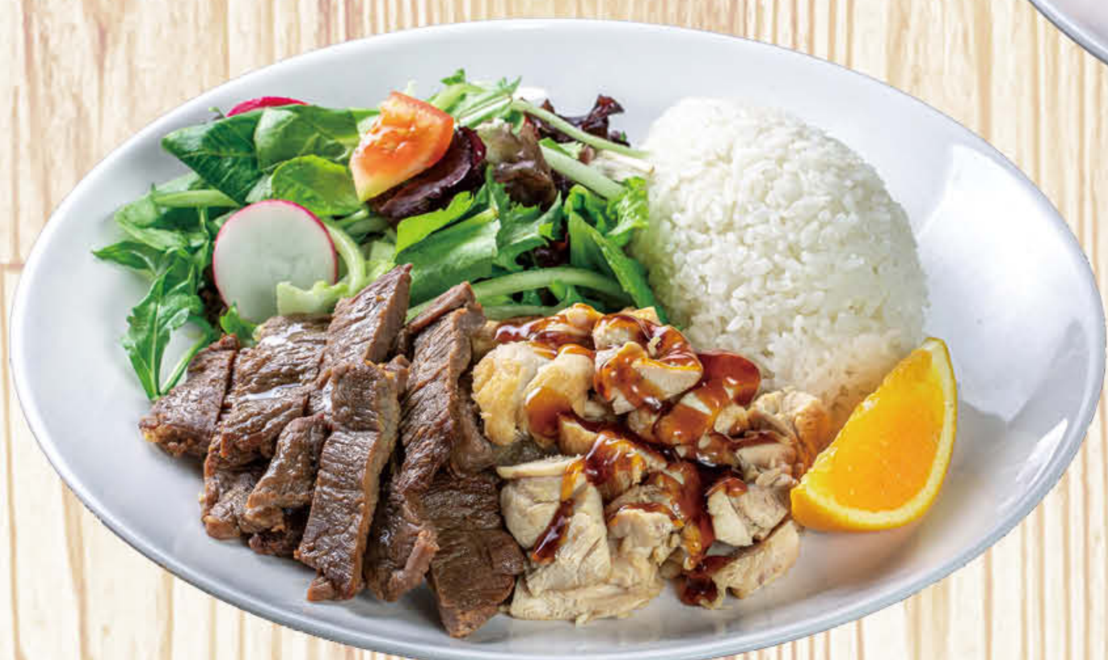
Chicken Beef Plate $17.43