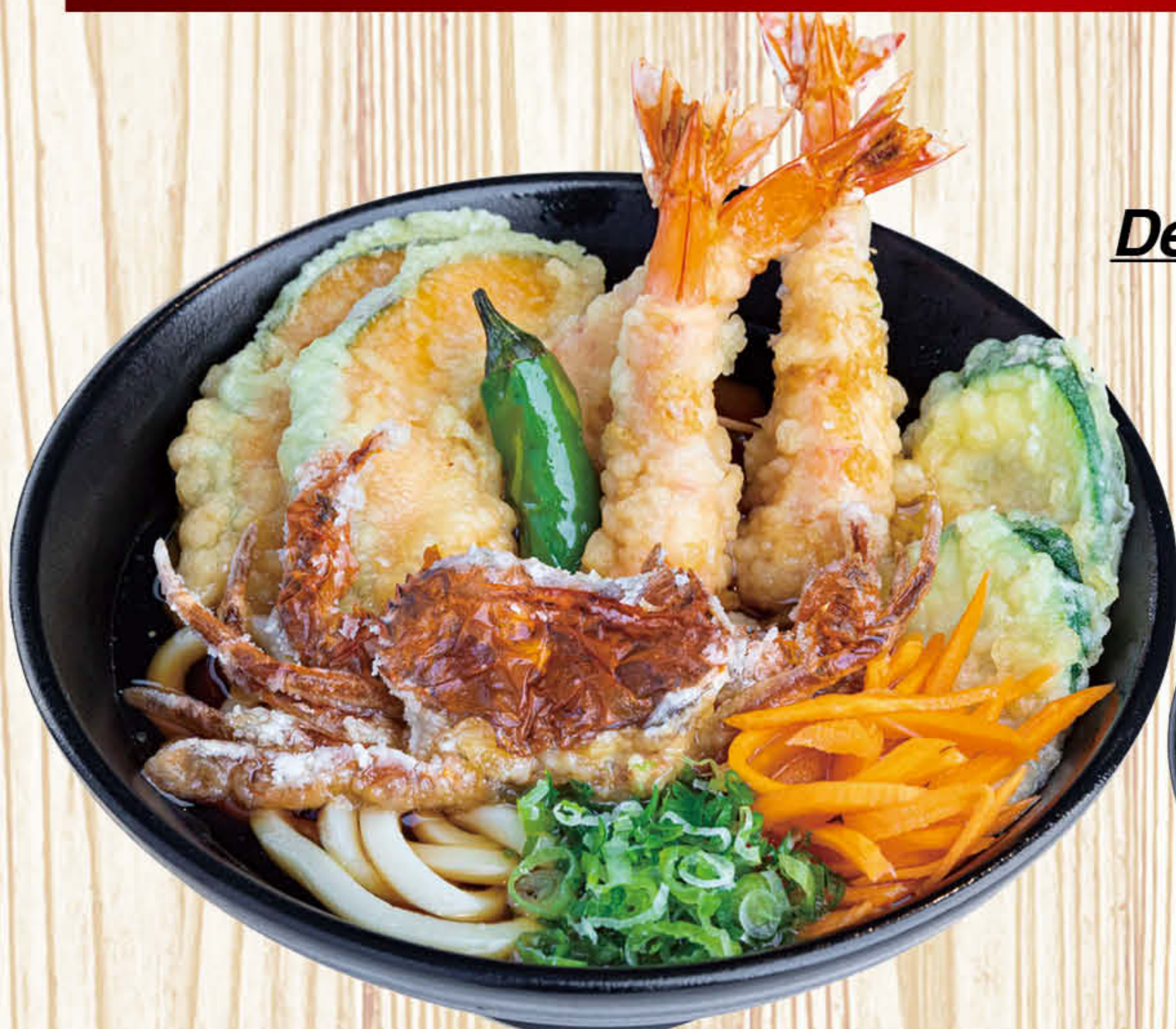
Deluxe Tempura Udon $18.09 Mini Tempura Udon $7.23