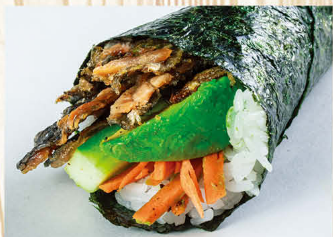
Salmon Skin Hand Roll $5.31