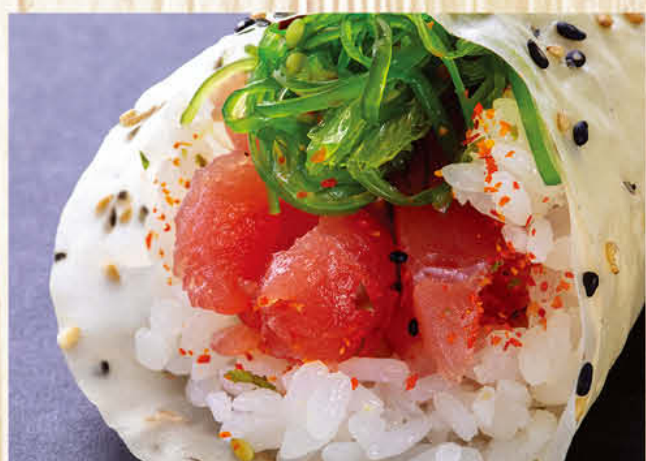
*Tuna Poke Hand Roll $5.57