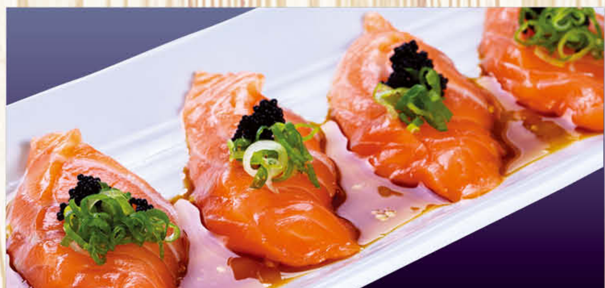
*Salmon Truffle Sauce Sashimi $10.73