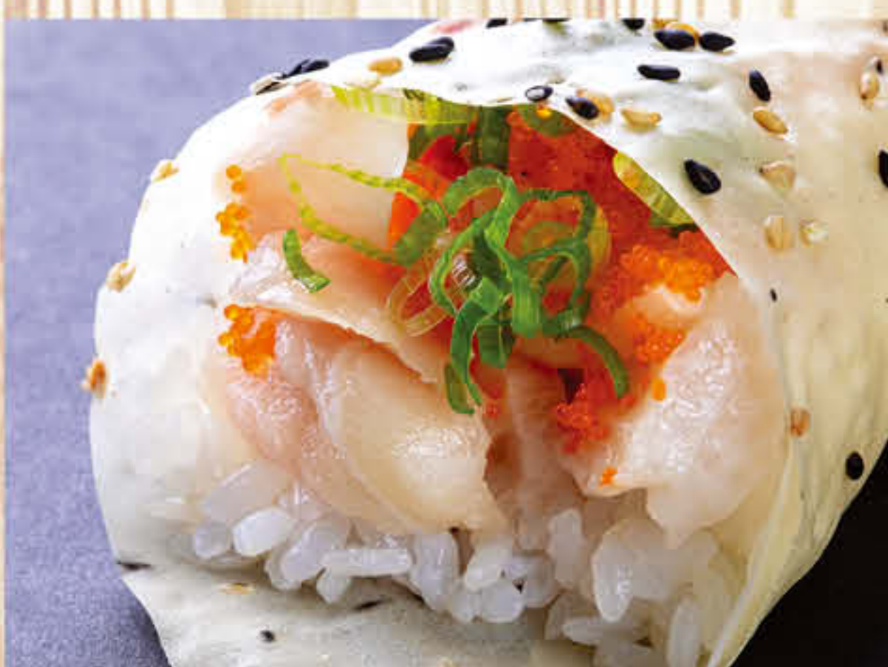
*Yellowtail Truffle Hand Roll $5.73