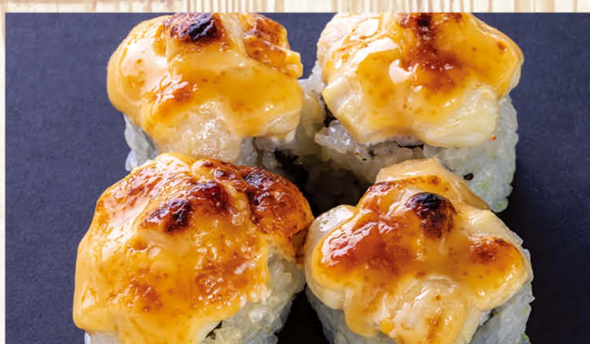
*Dynamite Bay Scallop Roll $5.95