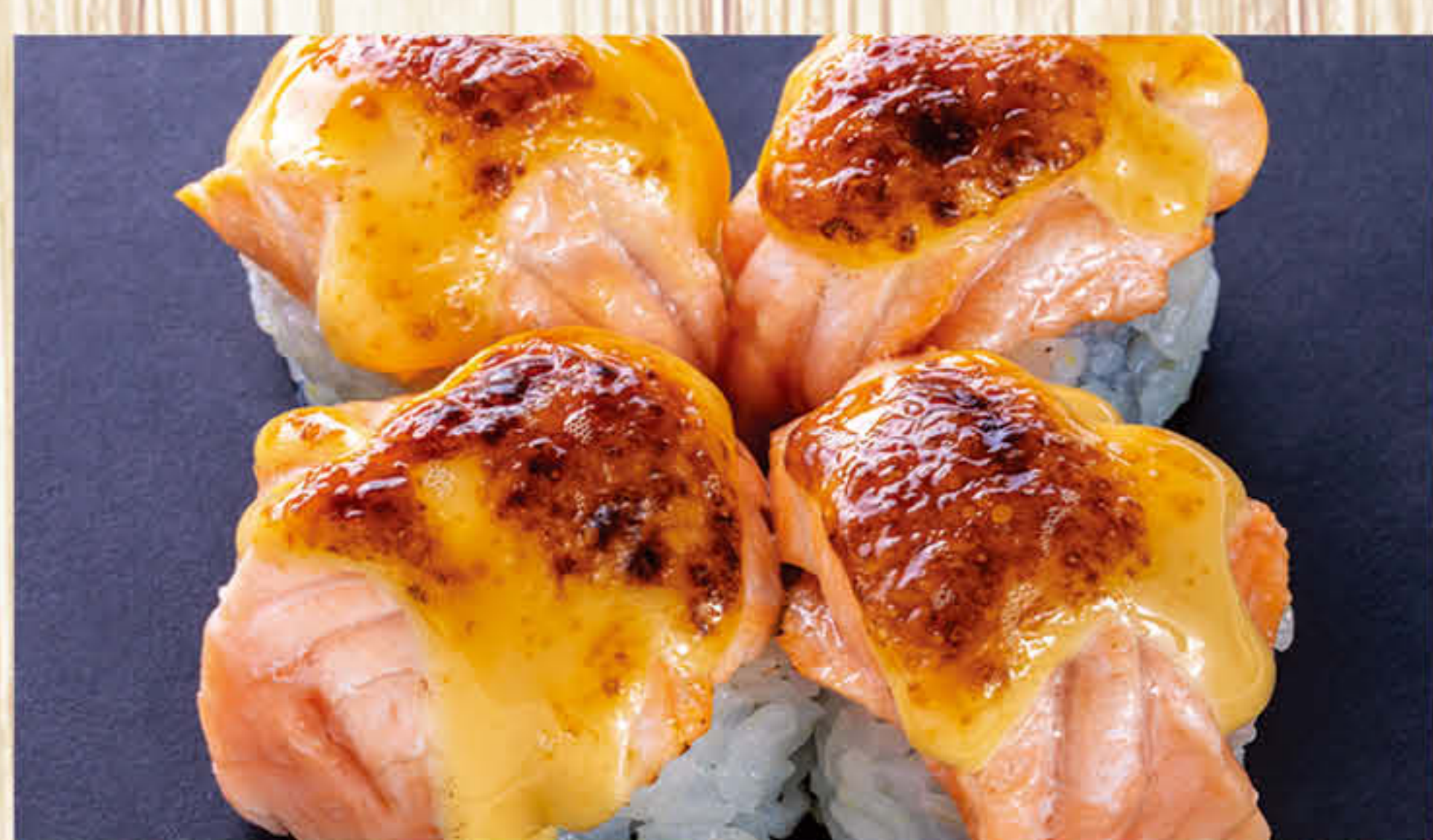
*Baked Salmon Roll $5.95