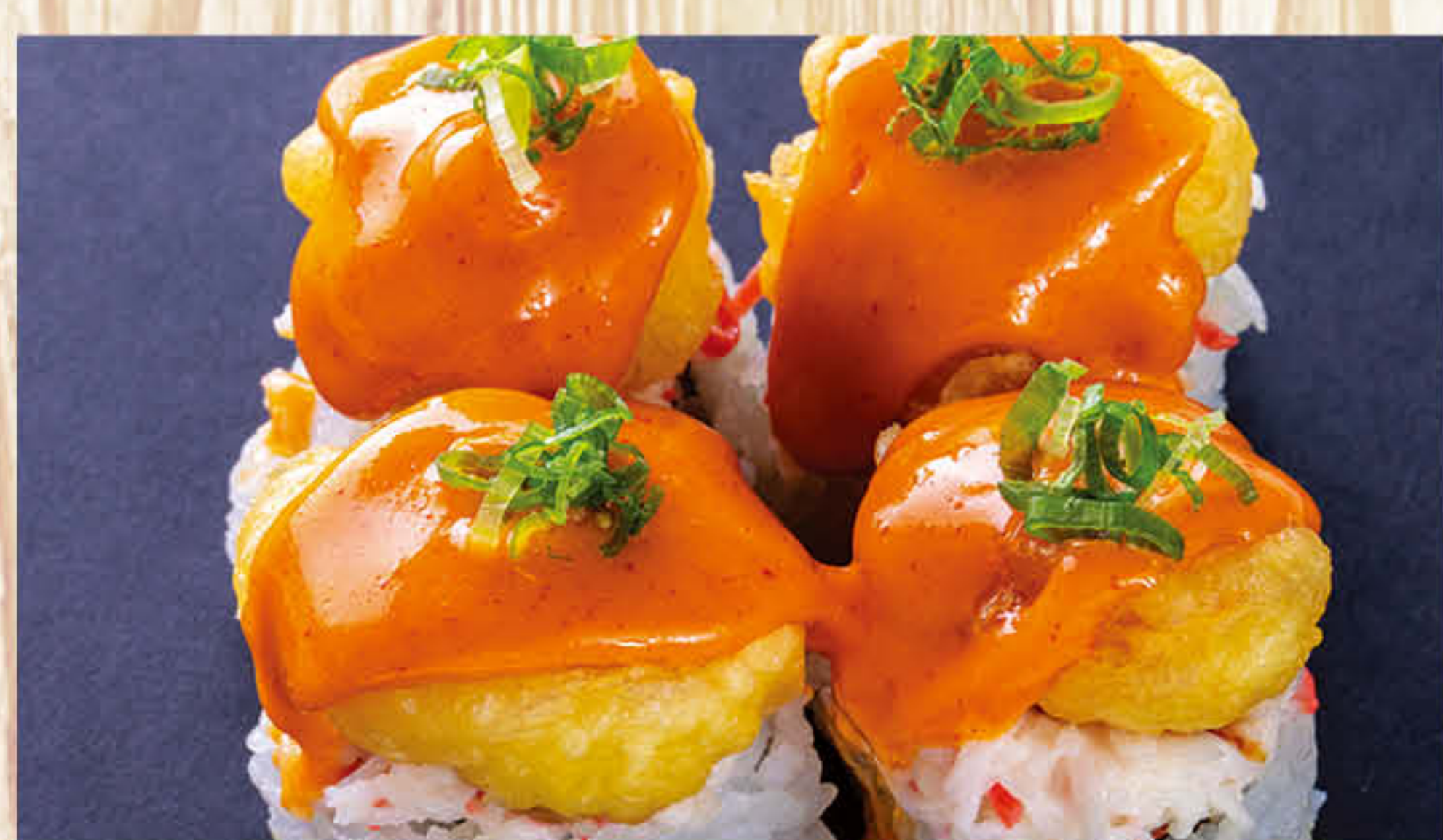
Popcorn Shrimp Roll $5.73