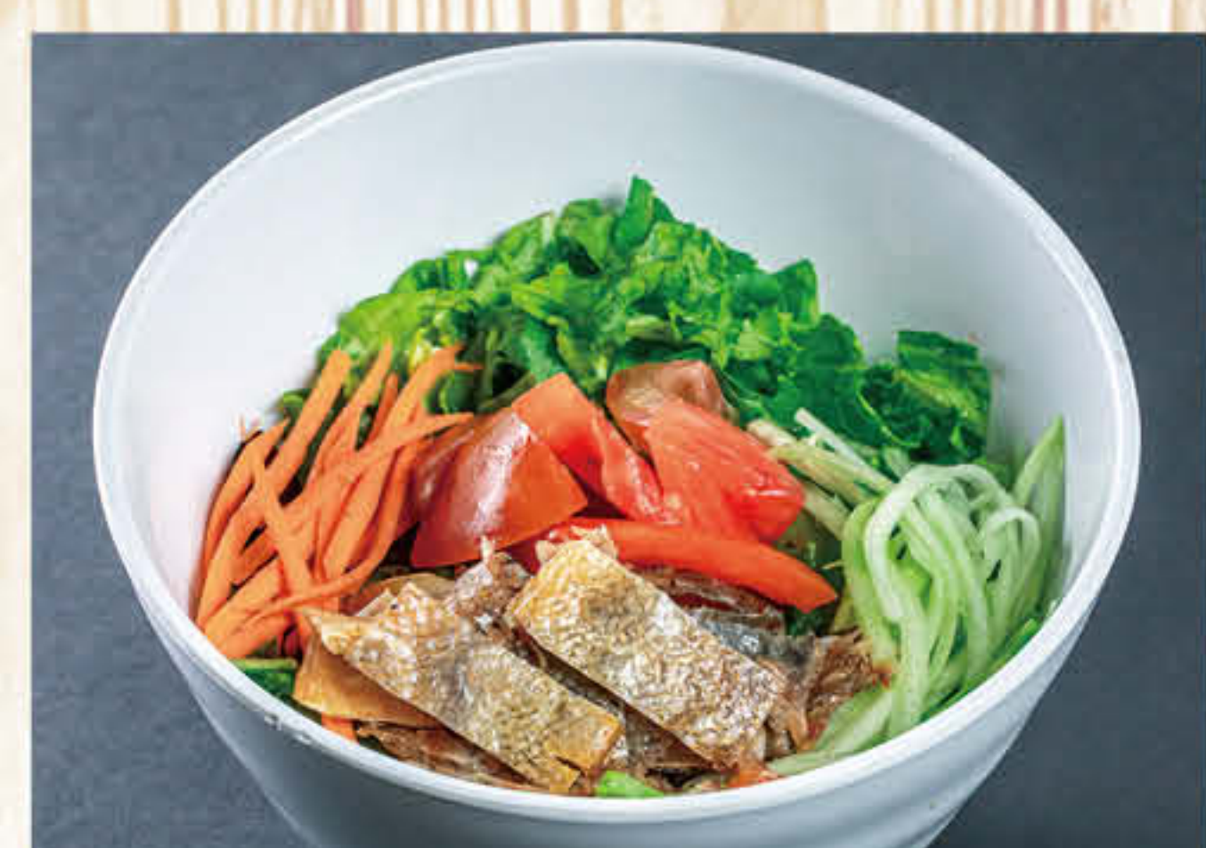
Salmon Skin Salad $7.39