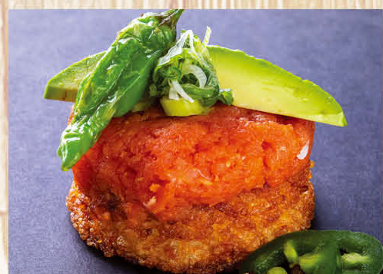
*Crispy Rice $6.15