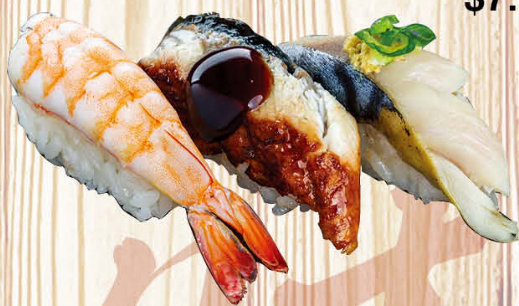
*Edomae Trio Sushi $7.25