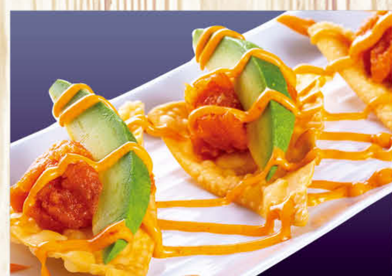
*Spicy Albacore Chips $6.87