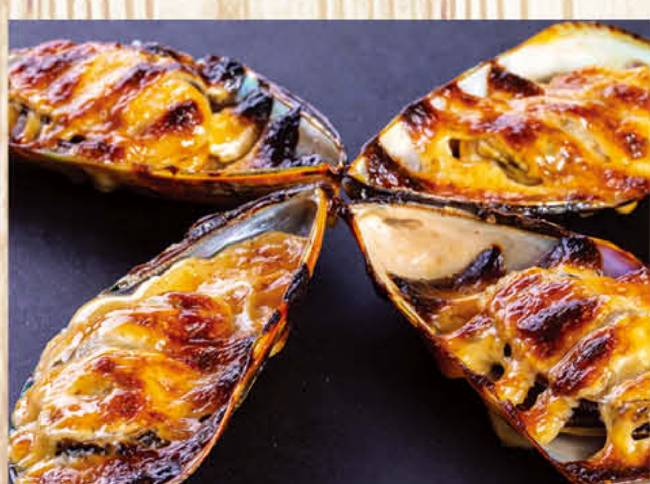
*Dynamite Mussels $7.13