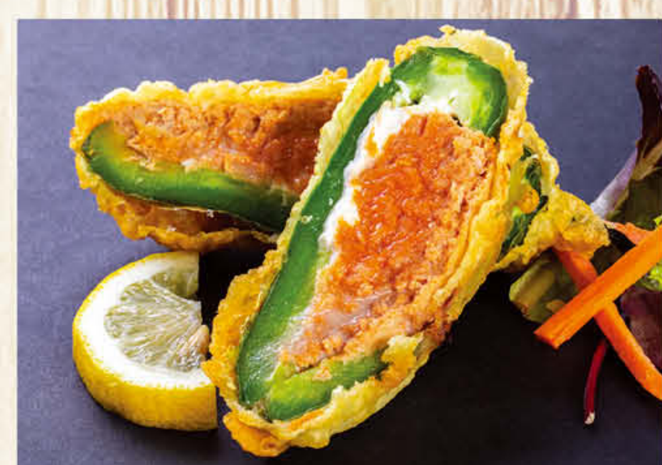
*Tempura Cheese Jalapeno $6.21