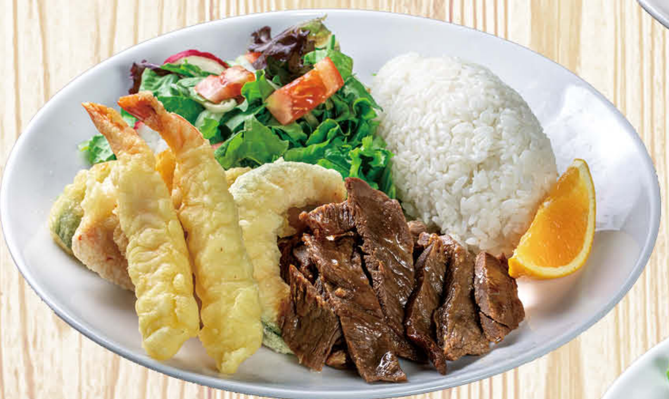
Beef Tempura Plate $16.95