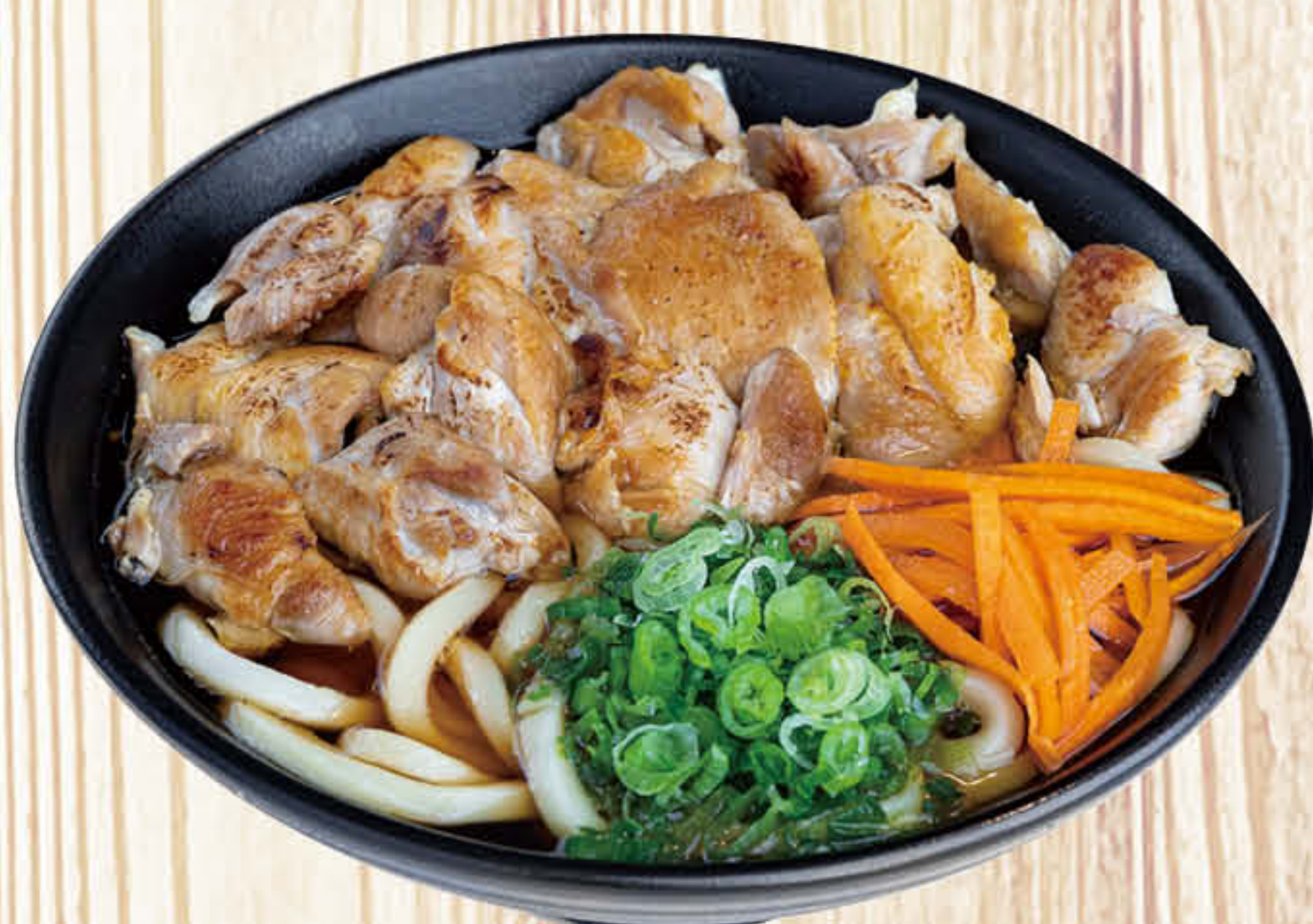
Chicken Grilled Udon $17.15