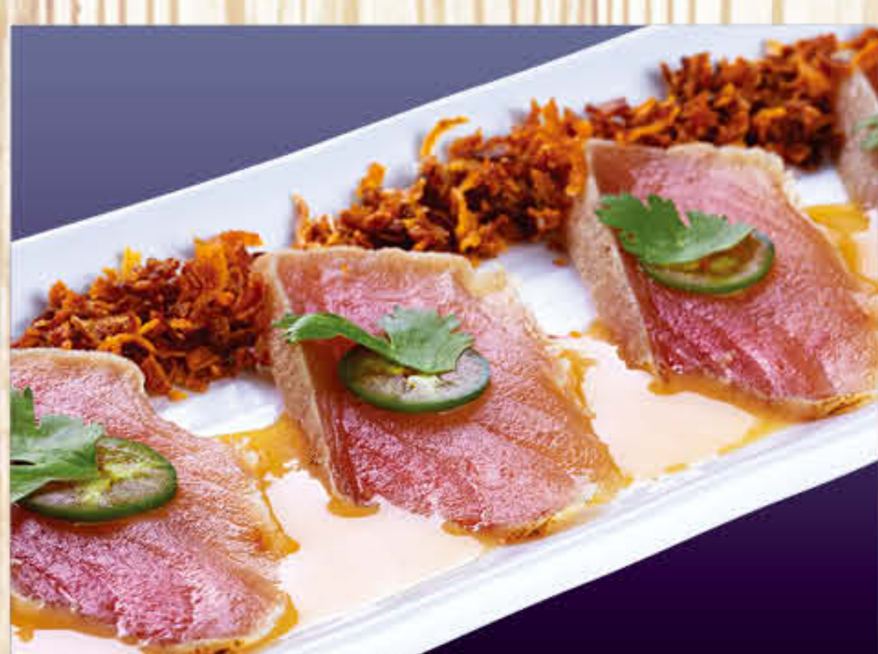
*Albacore Miso Sauce Sashimi $9.79