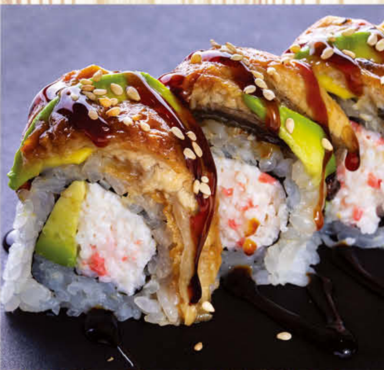
Dragon Roll $8.95 California roll. Topped with eel, avocado, eel sauce, and sesame seeds.