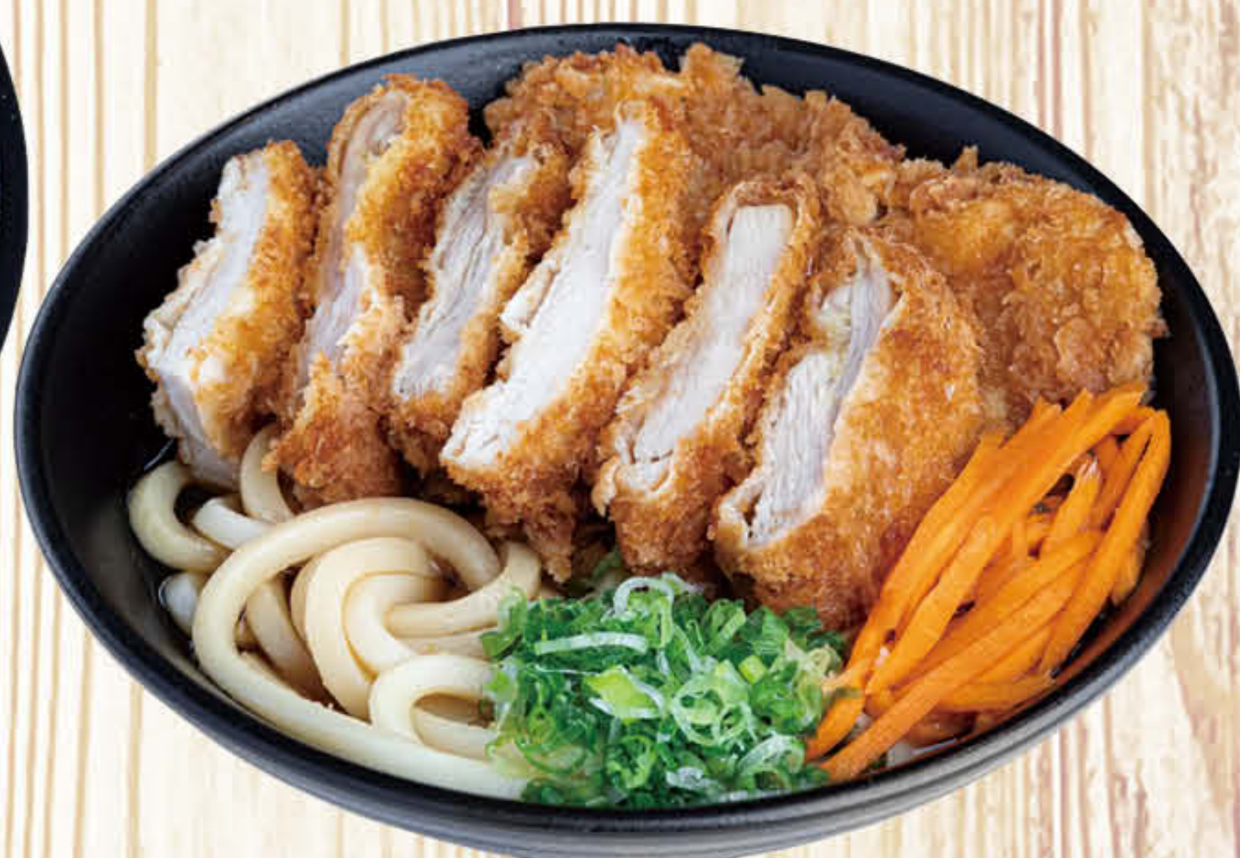
Chicken Cutlet Udon $17.17