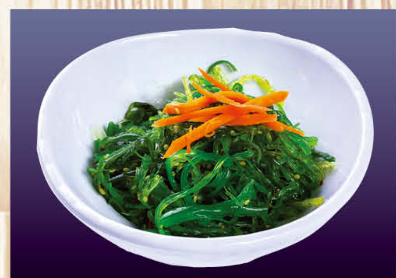
Seaweed Salad $5.03