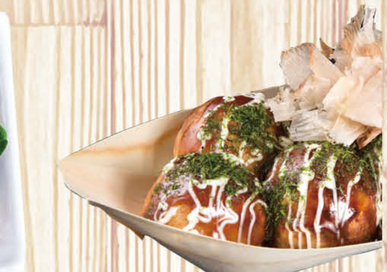
New Takoyaki (3pcs) $4.57