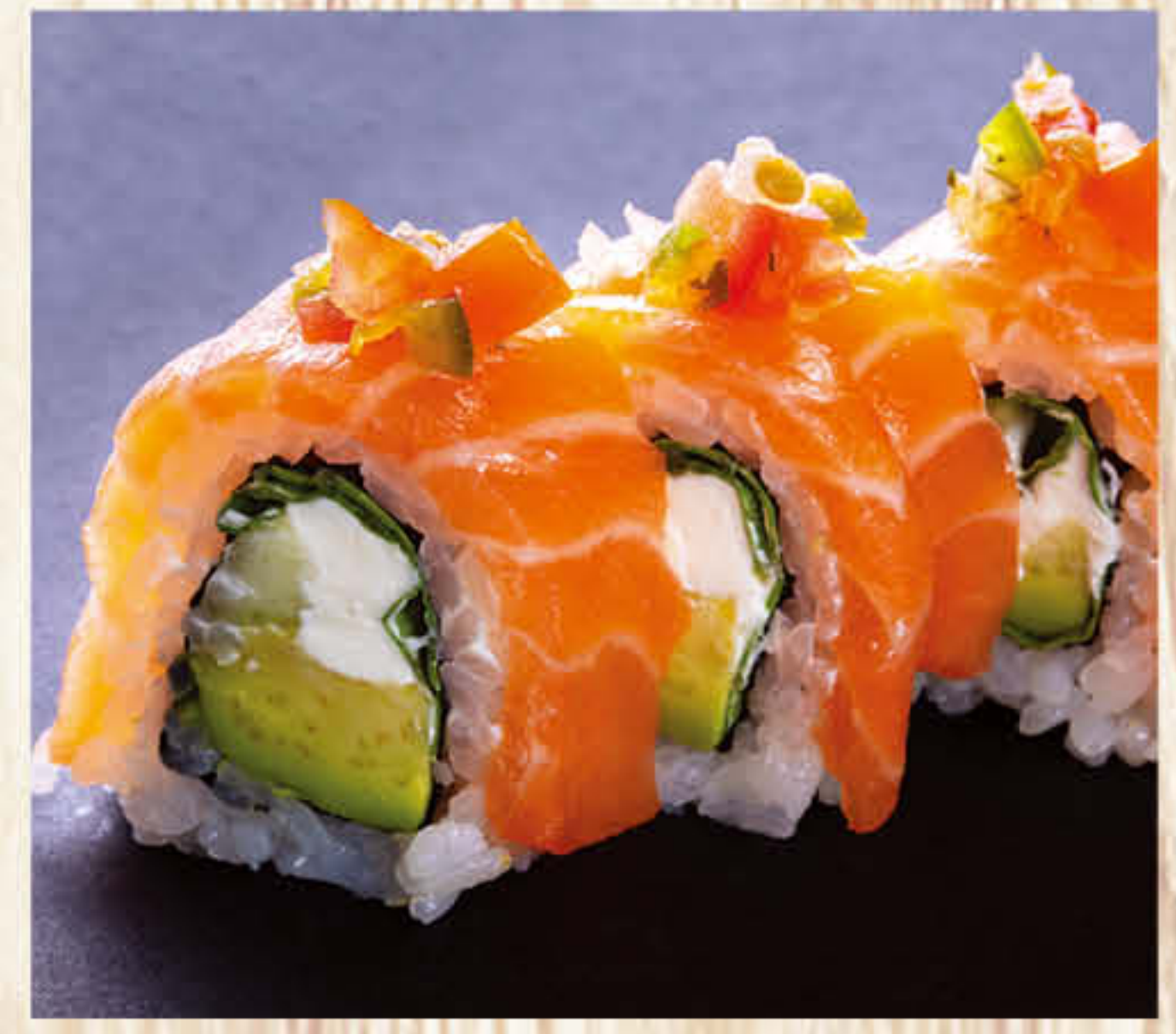
*Veggie Salmon Ceviche Roll $8.63 Lettuce, avocado, cucumber, and cream cheese roll. Topped with salmon and ceviche sauce.