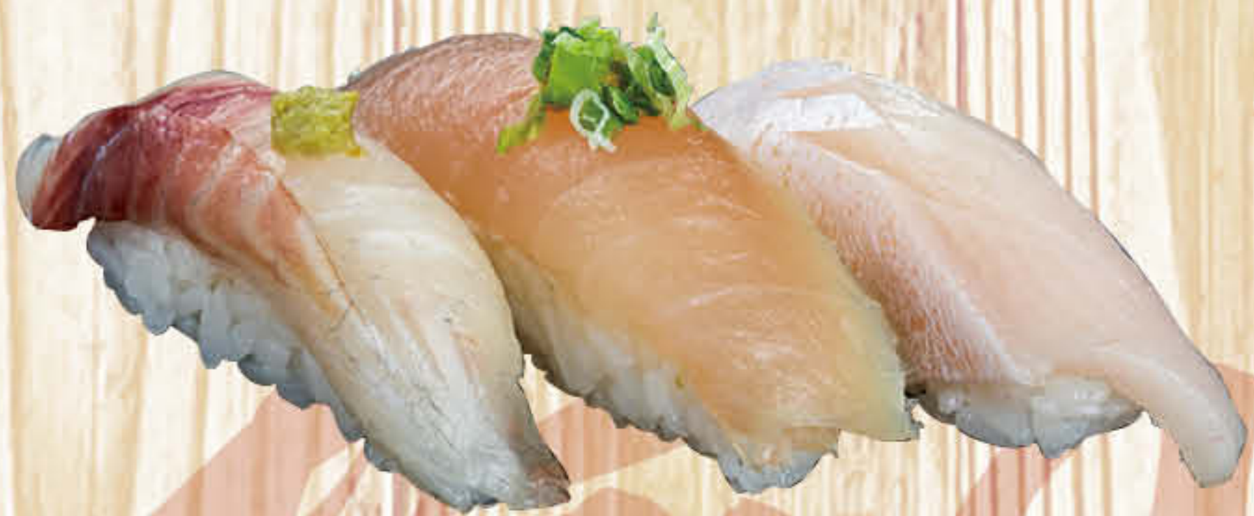
*Shiromi Trio Sushi $7.03