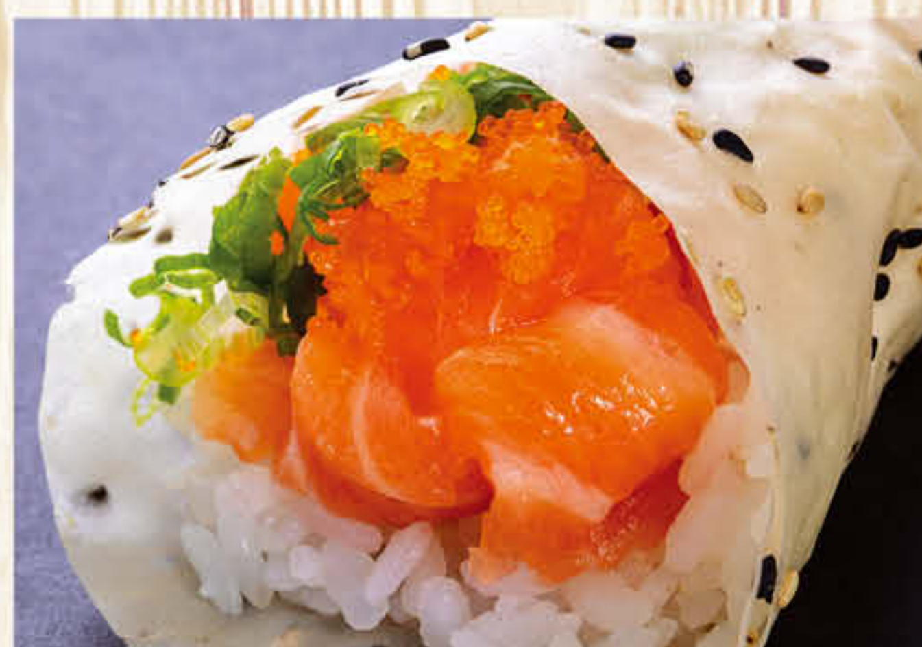
*Salmon Truffle Hand Roll $5.73