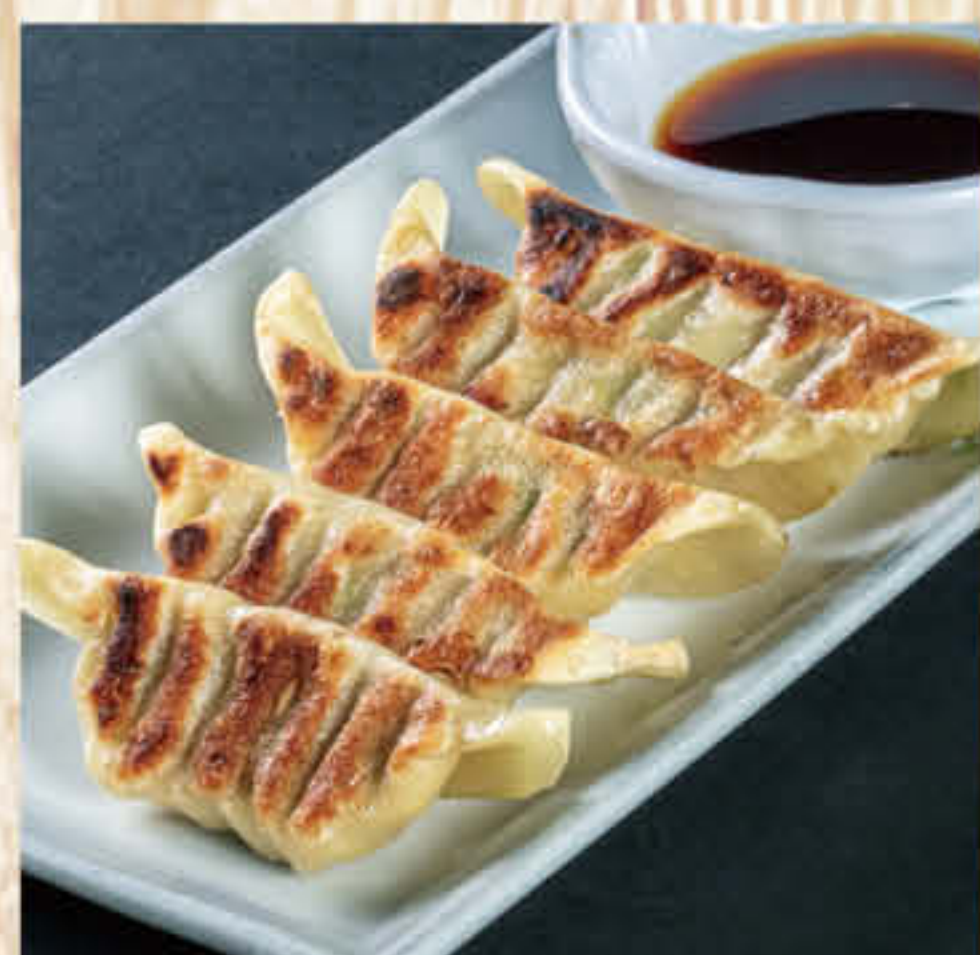
Pan Fried Gyoza $5.53