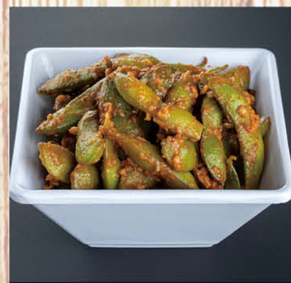
Spicy Garlic Edamame $5.73