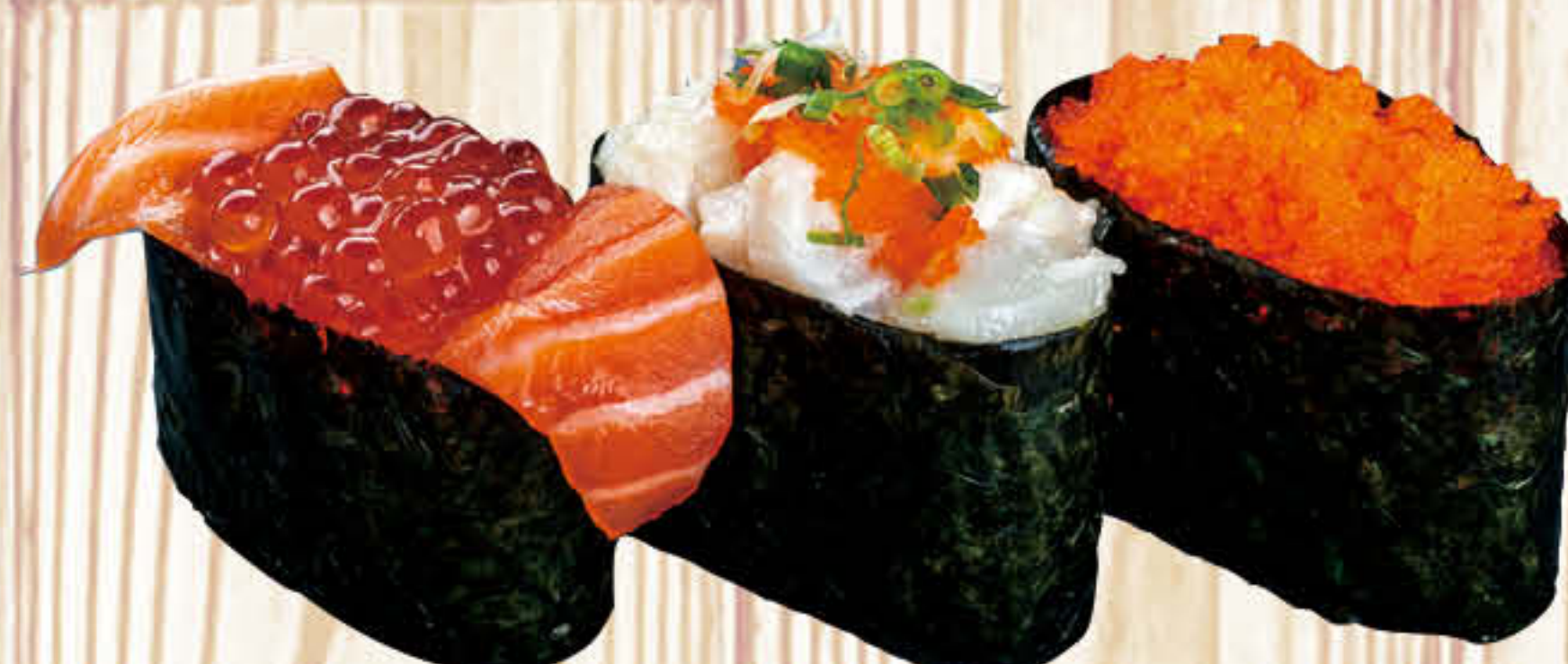
New *Gunkan Trio Sushi $7.03

*Raw Fish CONSUMER ADVISORY: Items marked with an asterisk may be served raw or undercooked meats, poultry, seafood, shellfish, or eggs, which may increase your risk of foodborne illness, especially if you have certain medical conditions.