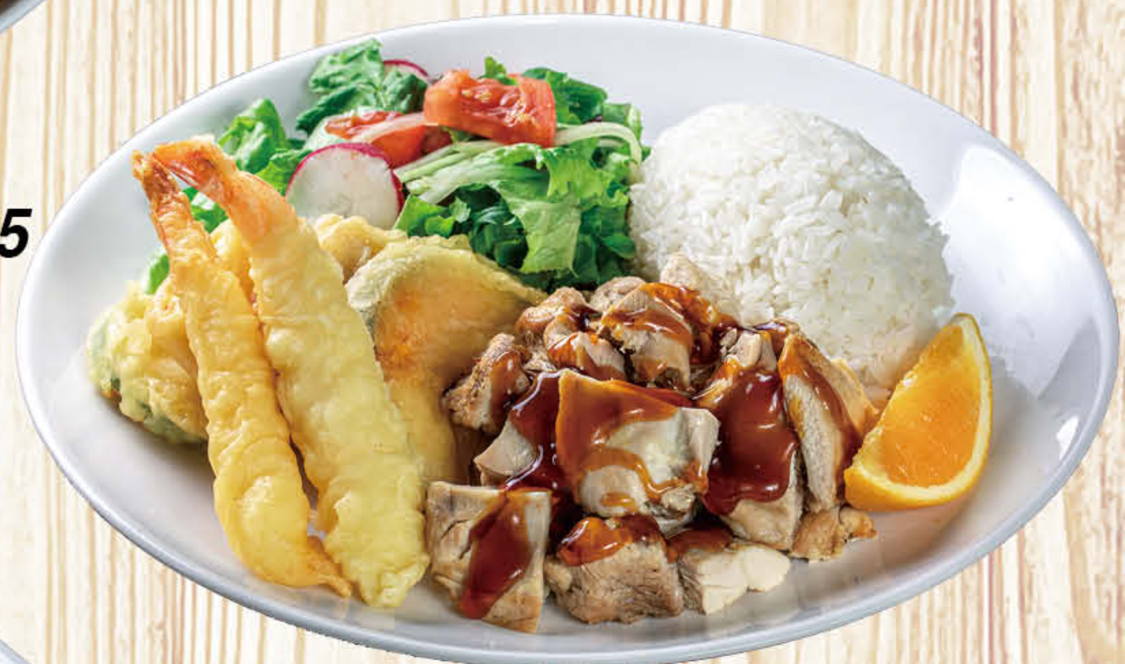
Chicken Tempura Plate $16.21