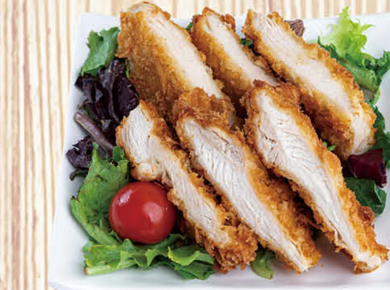
New Chicken Cutlet $6.95