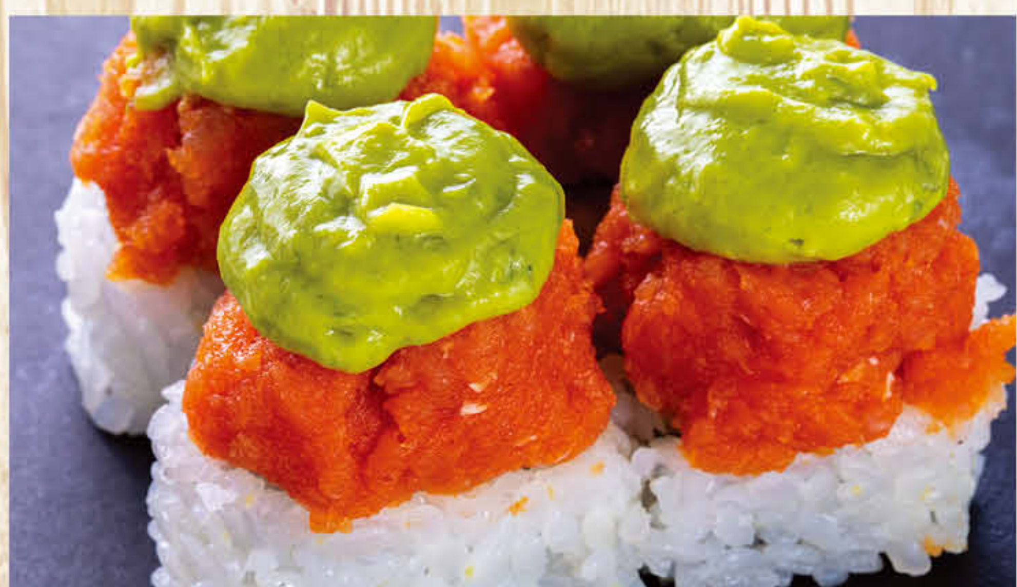
*Spicy Tuna Guacamole Roll $4.89