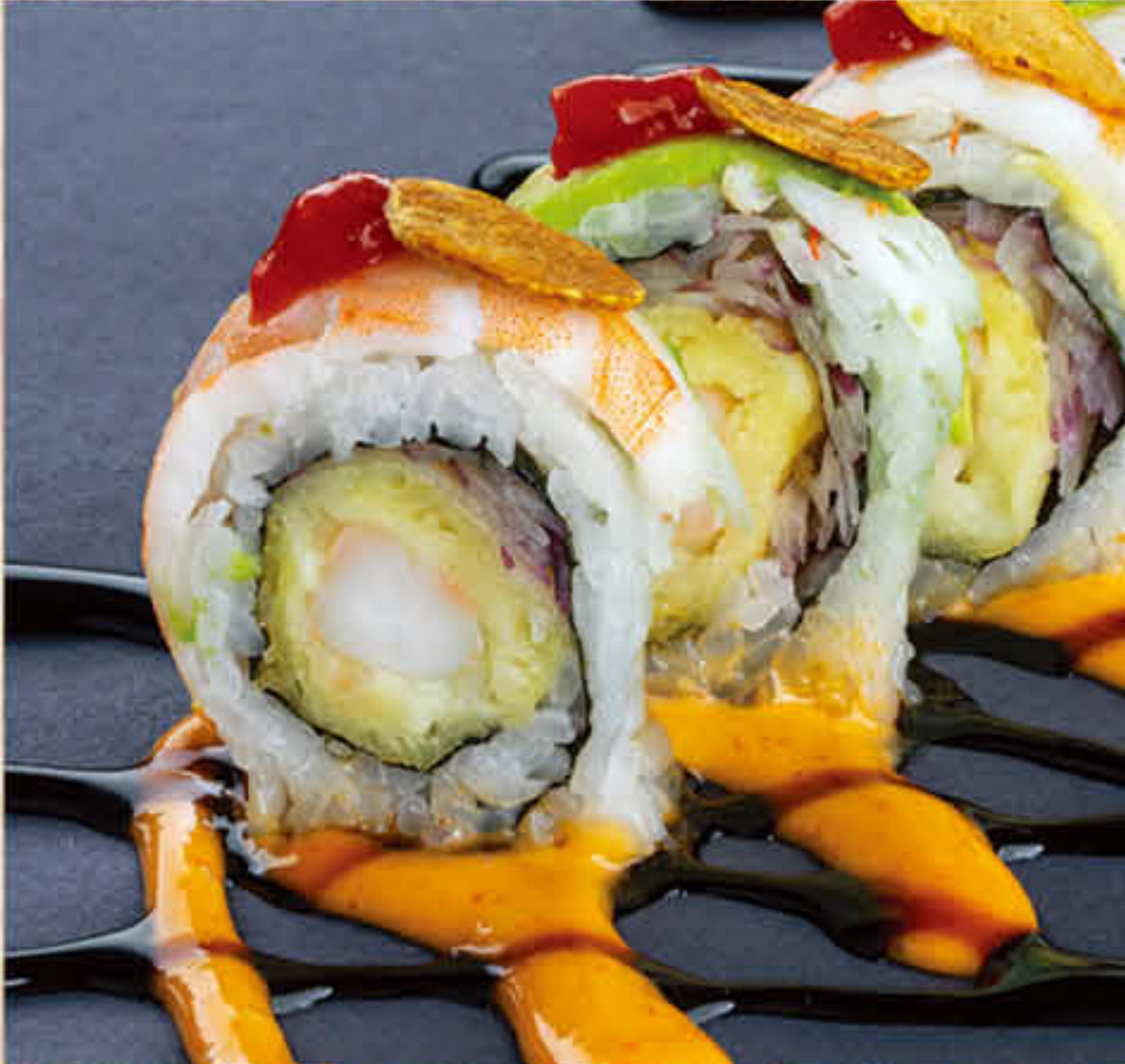
Double Shrimp Roll $7.91 Shrimp Tempura, Avocado, and Red Onion roll topped with Shrimp, spicy mayo, eel sauce, sriracha, and garlic chips.