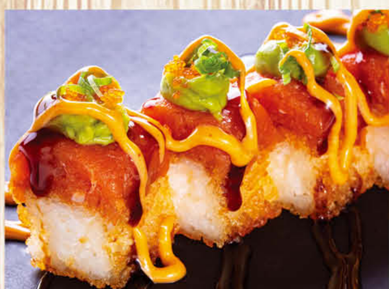
*Crunchy Rice $9.91