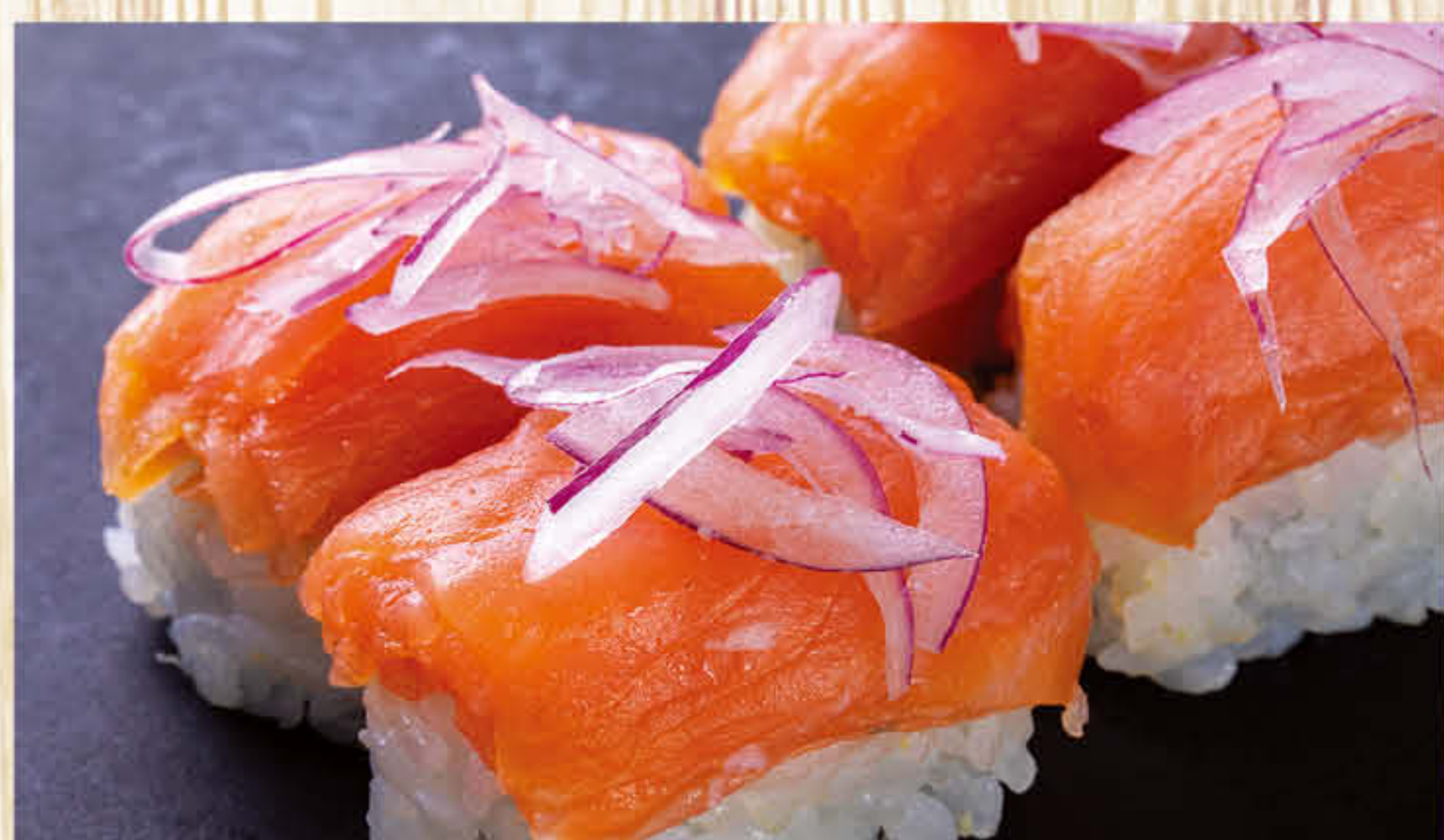
*Philly Salmon Roll $4.89