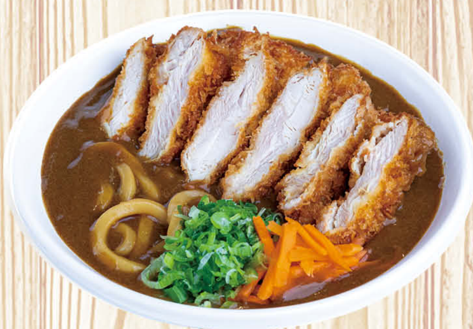
Chicken Cutlet Curry Udon $18.97