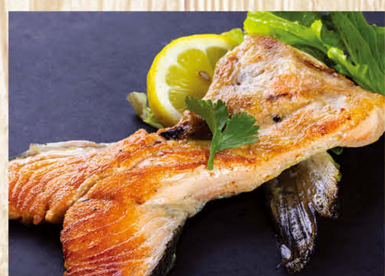
*Grilled Salmon Collar $8.65