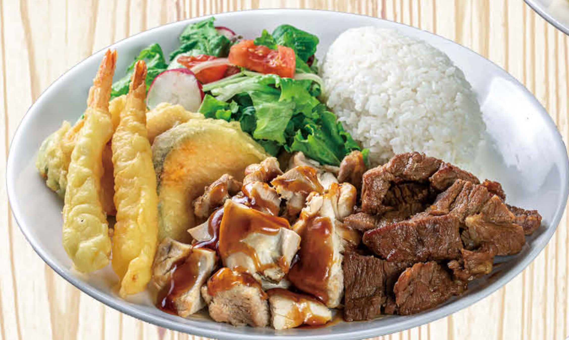
Chicken Tempura Beef Plate $19.55