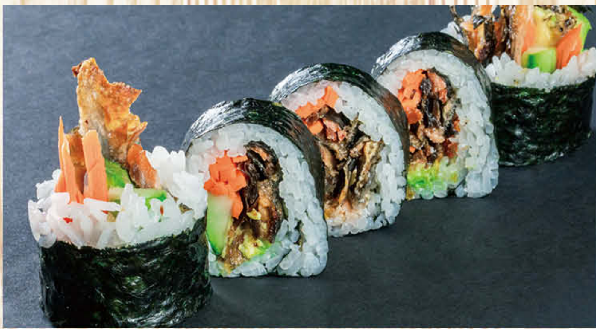
Salmon Skin Roll $7.91 Crispy salmon skin, avocado, carrot, cucumber.