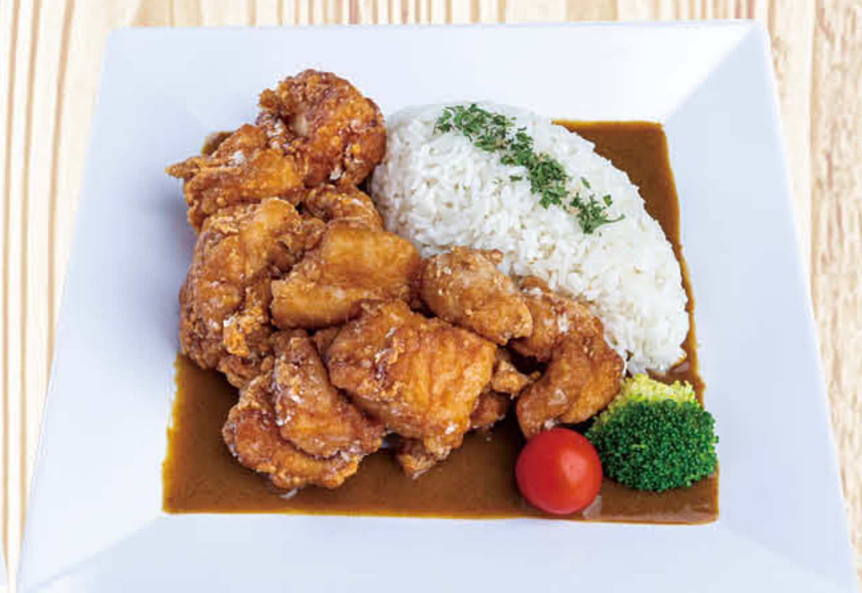
Chicken Karaage Curry $17.13