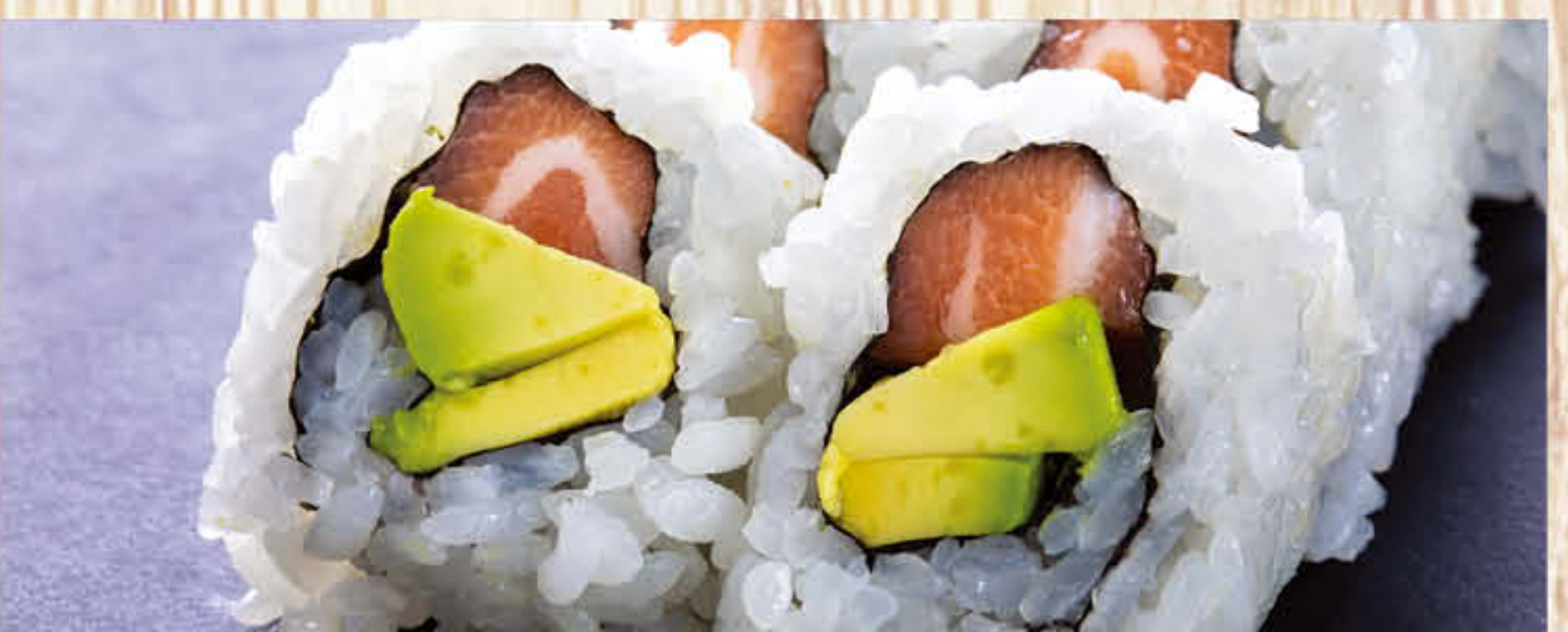
Avocado Roll $6.11 Cucumber Roll $5.51 Avocado Cucumber Roll $5.71 Vegetable Roll $5.51