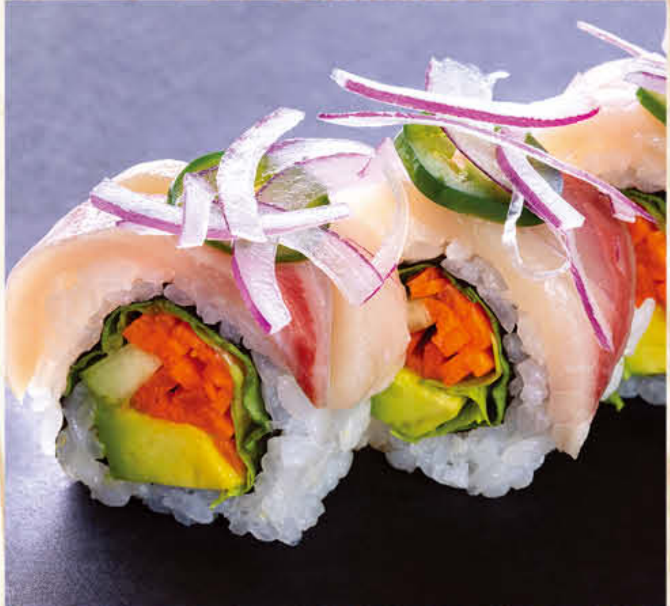
*Veggie Yellowtail Roll $8.63 Lettuce, carrot, and avocado roll. Topped with yellowtail, raw onion, jalapeno, garlic ponzu, and Sriracha.