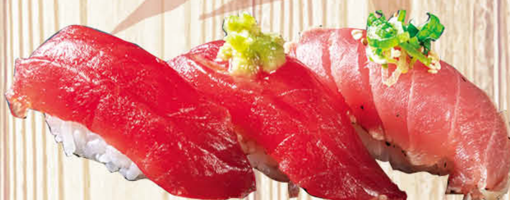
*Tuna Sampler Sushi $8.19