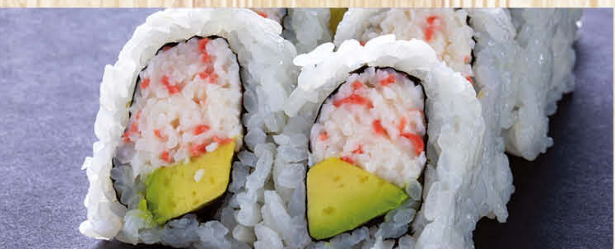
*Salmon Avocado Roll $5.75 California Roll $5.59 *Spicy Tuna Roll $5.75 Eel Avocado Roll $6.83 *Spicy Scallop Roll $5.75