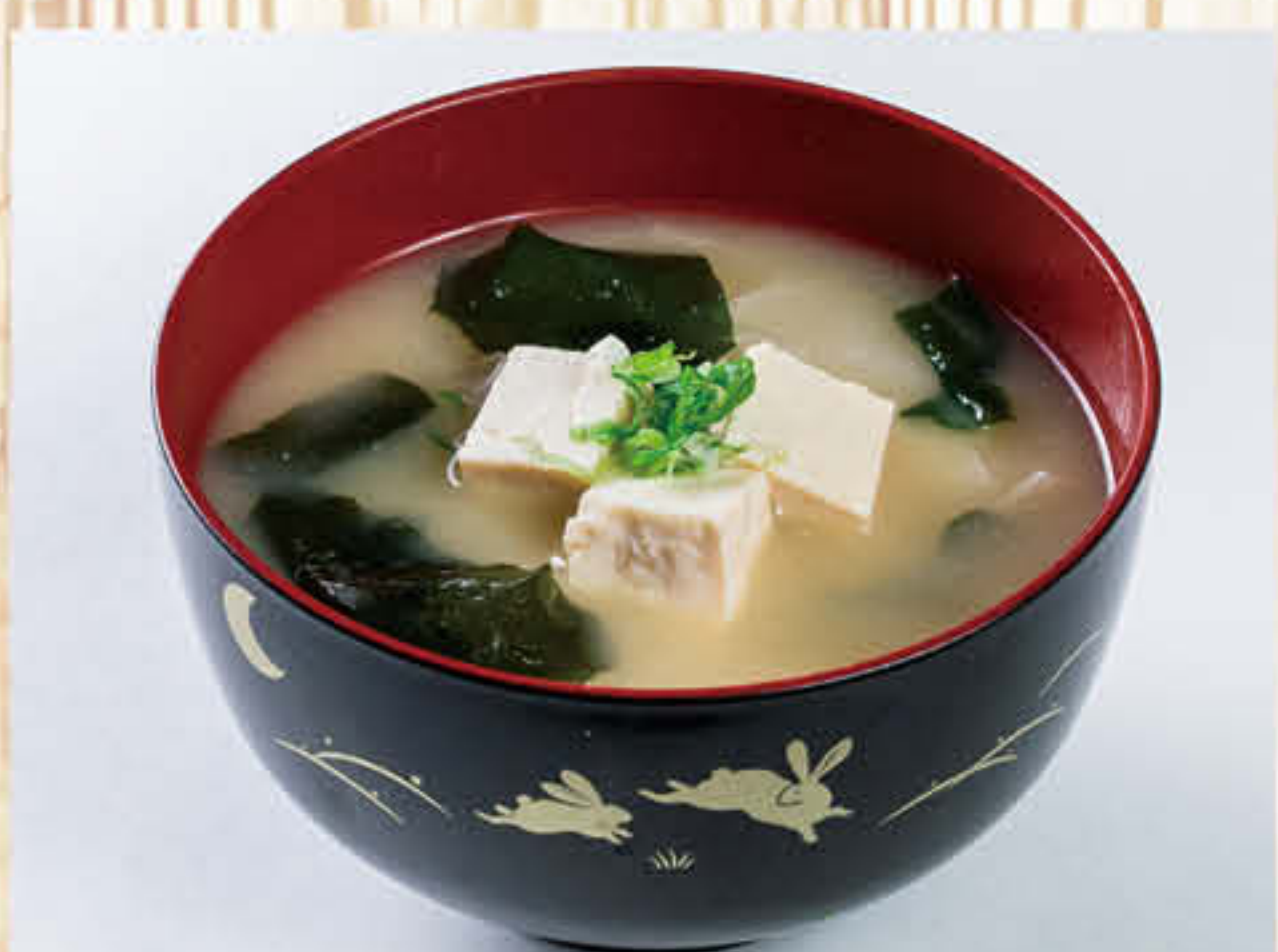
Miso Soup $3.41