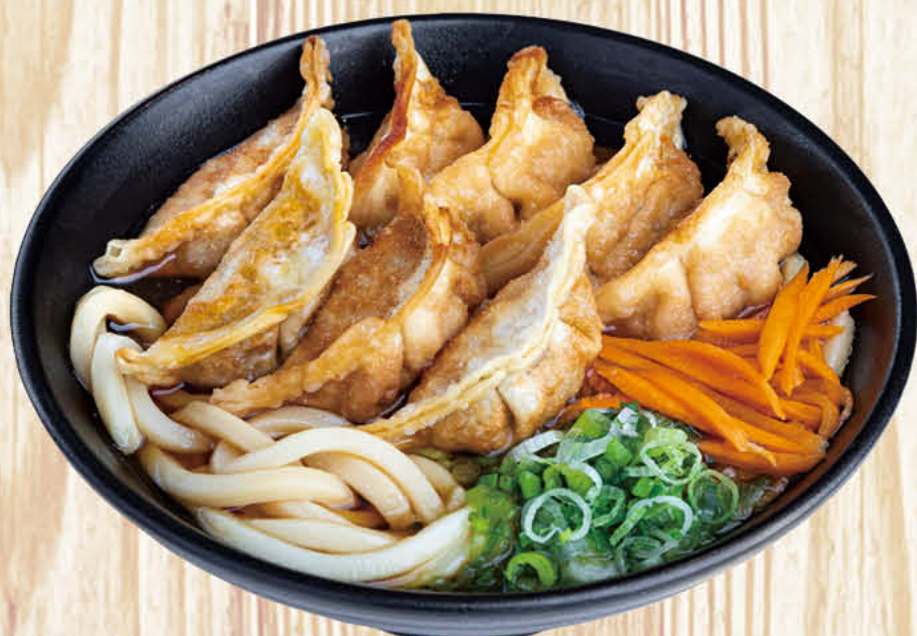
Chicken Gyoza Udon $16.21