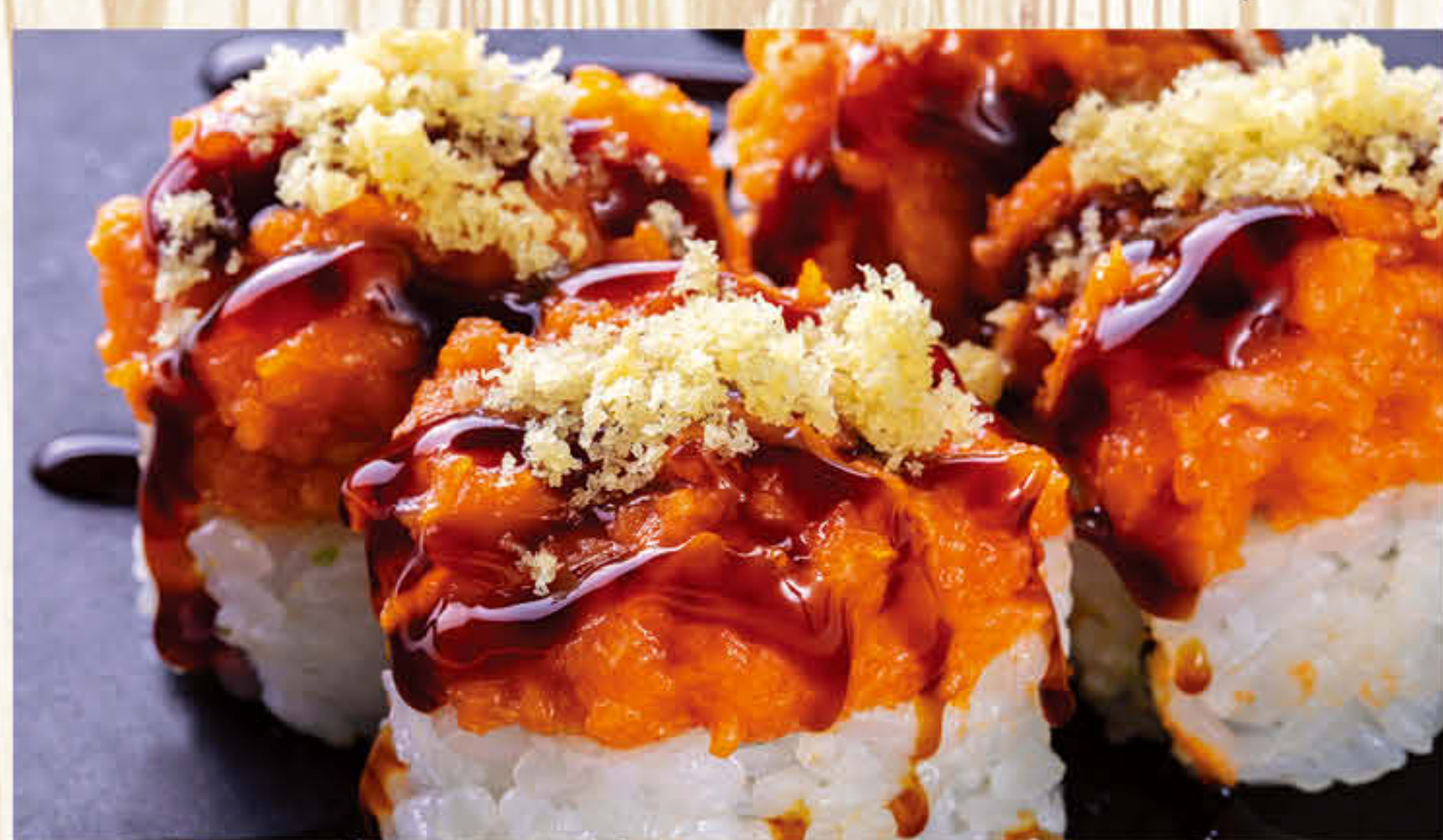
*Spicy Salmon Roll $5.73