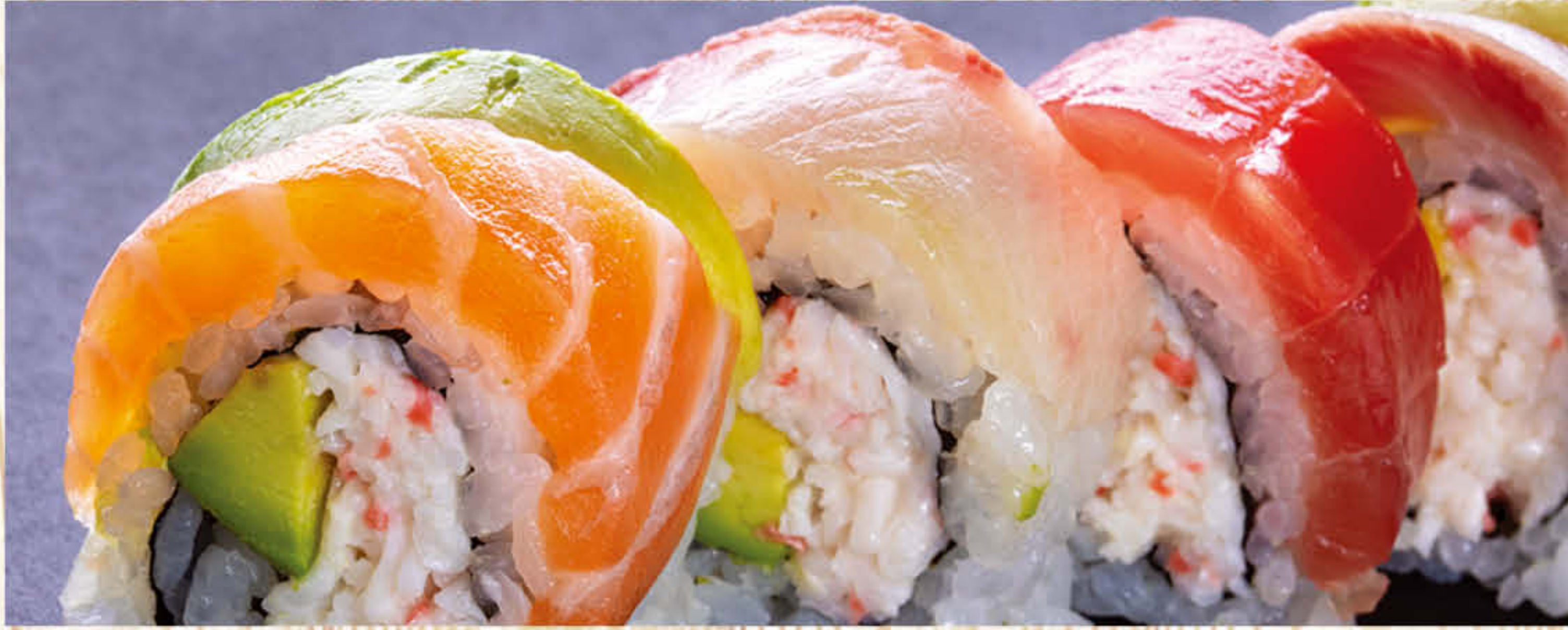
*Rainbow Roll $8.95 California roll. Topped with salmon, tuna, yellowtail, and avocado.