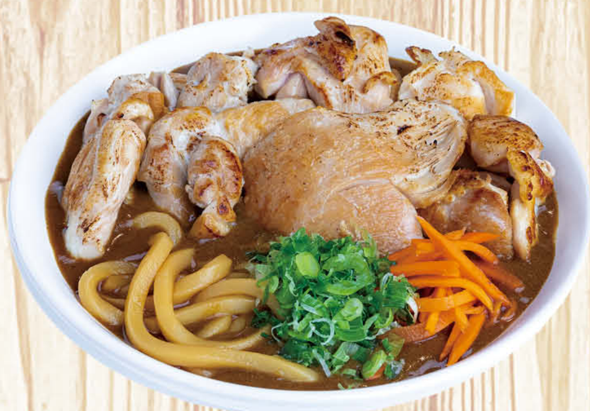
Chicken Grilled Curry Udon $18.97