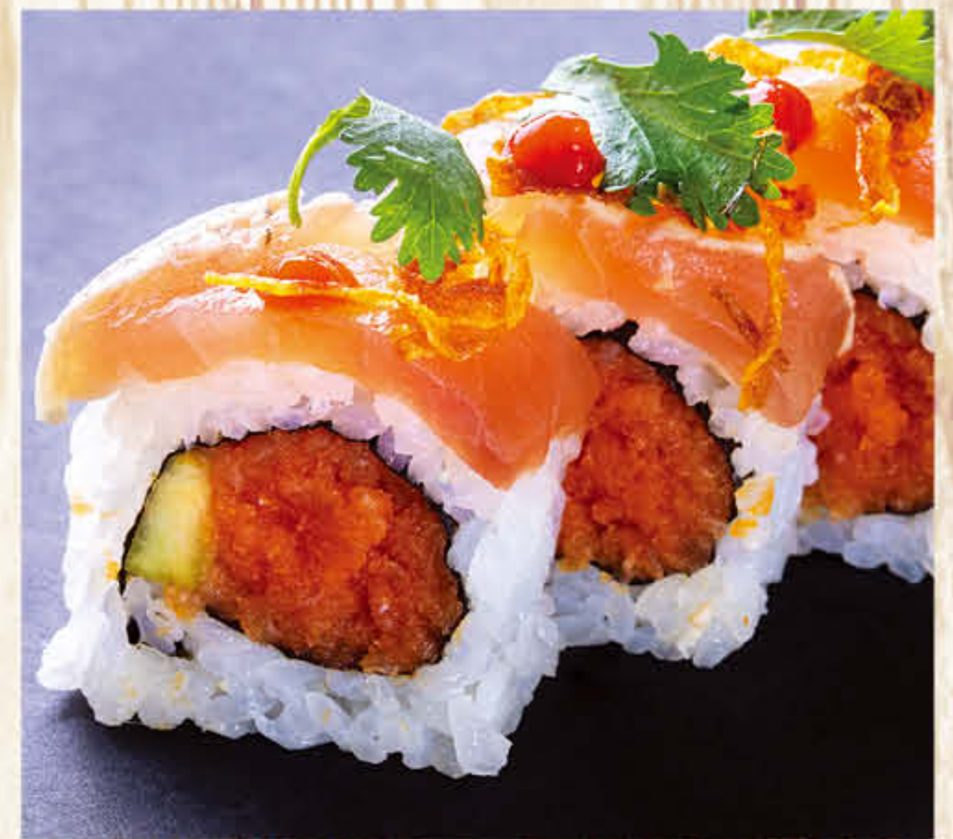
*Yuzu Albacore Roll $8.63 Spicy tuna and cucumber roll. Topped with Sriracha, cilantro, fried onion, and garlic ponzu.