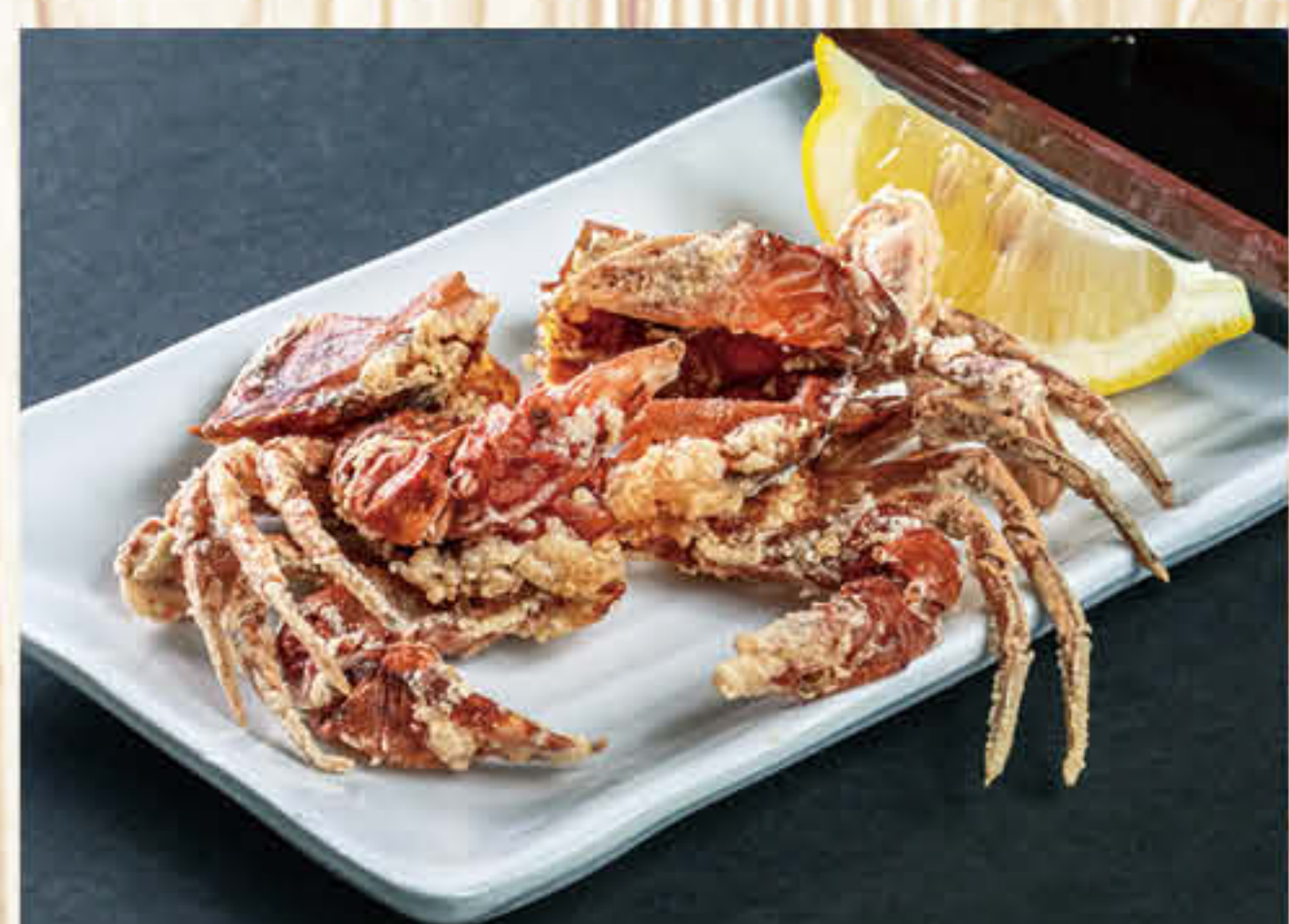
Soft Shell Crab $6.57