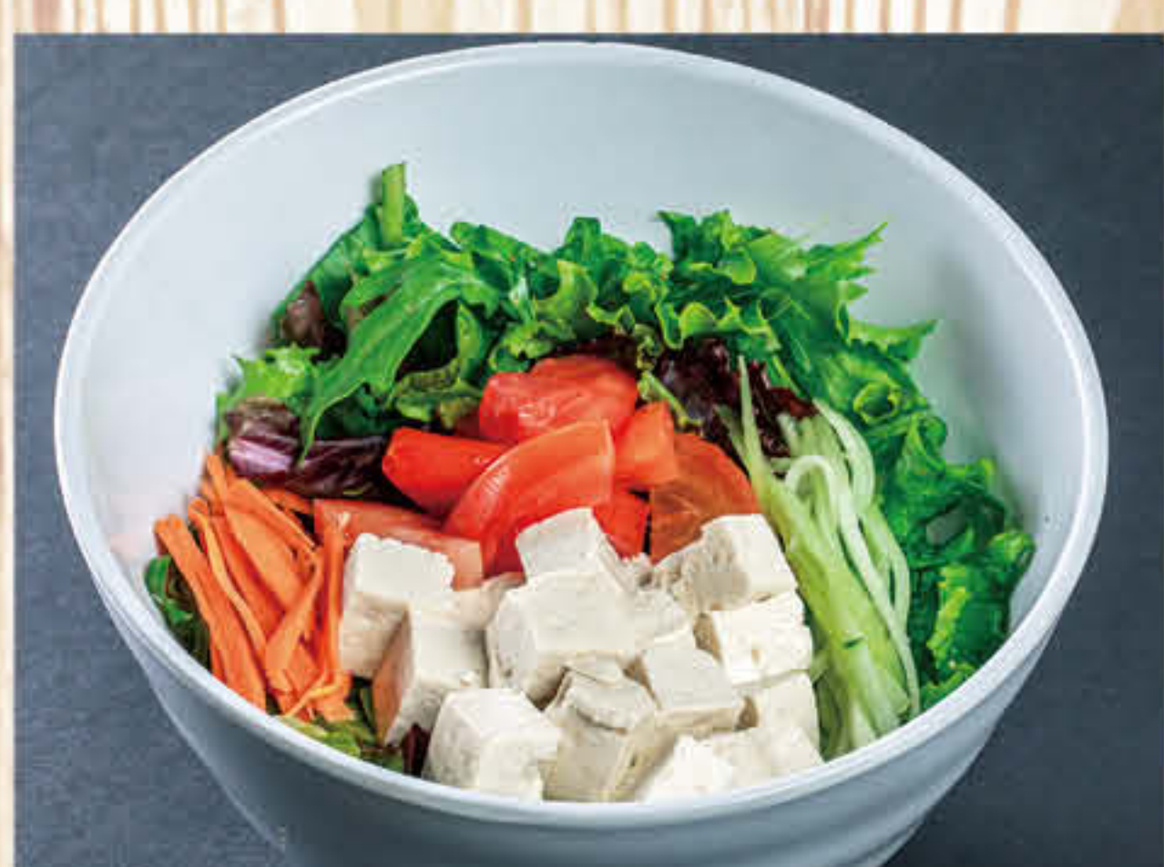
Tofu Salad $7.15