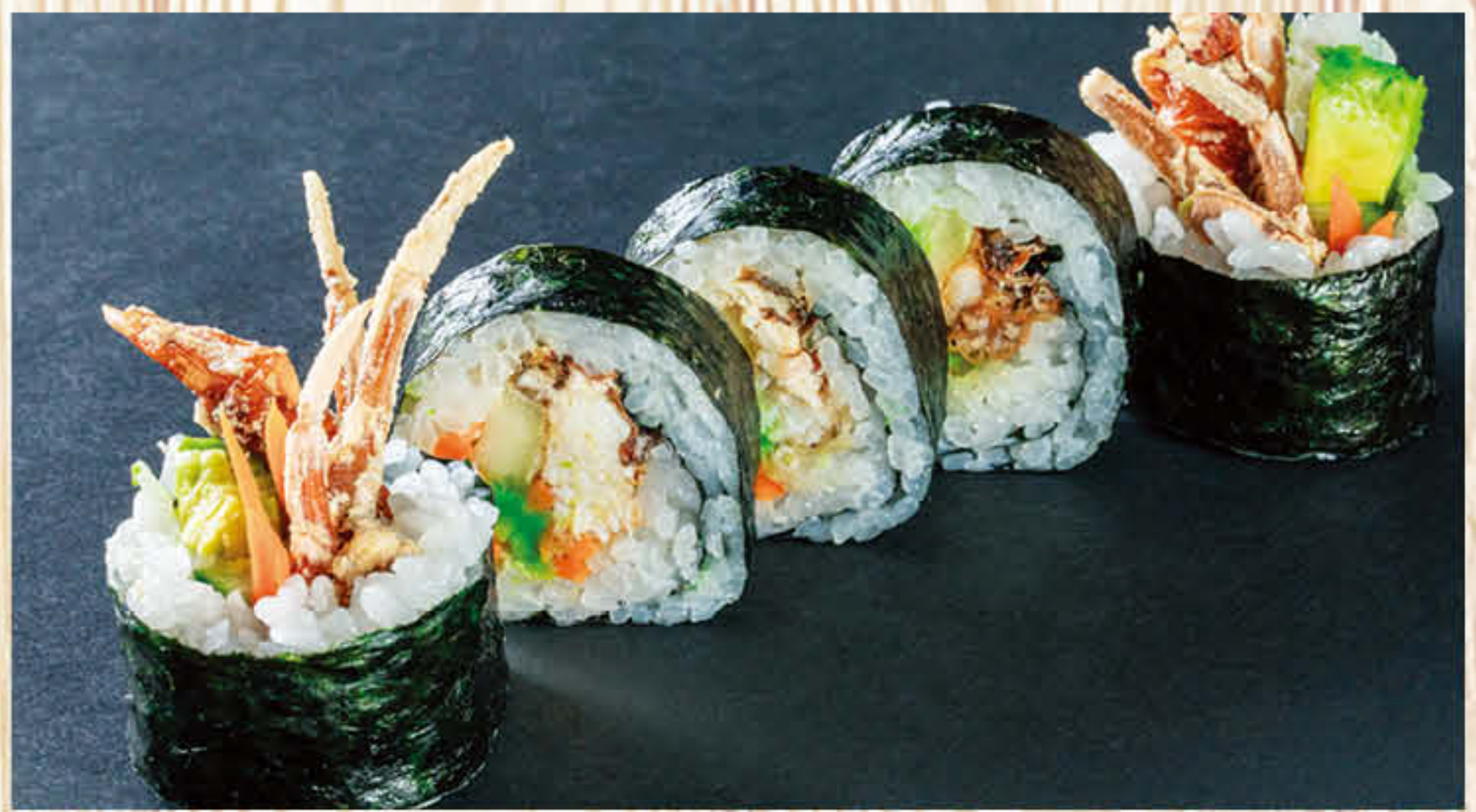
Spider Roll $8.95 Deep fried soft shell crab, avocado, carrot, cucumber.