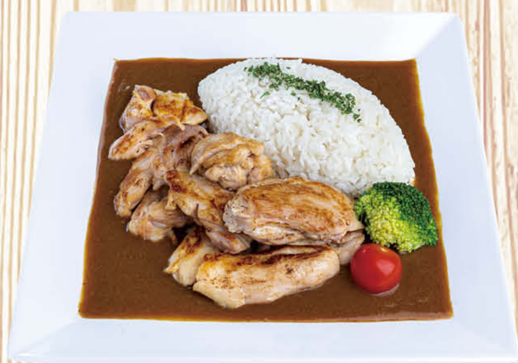
Chicken Grilled Curry $16.27