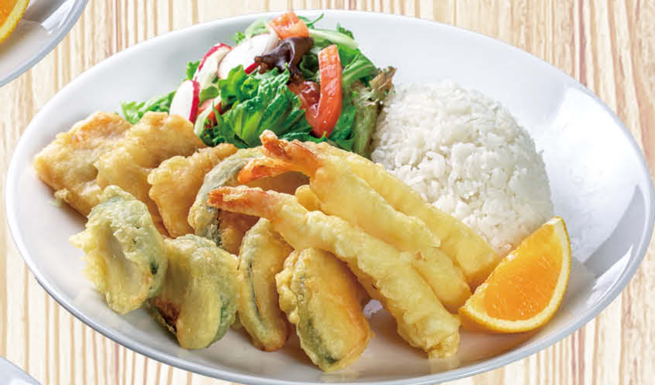
Tempura Plate $15.97