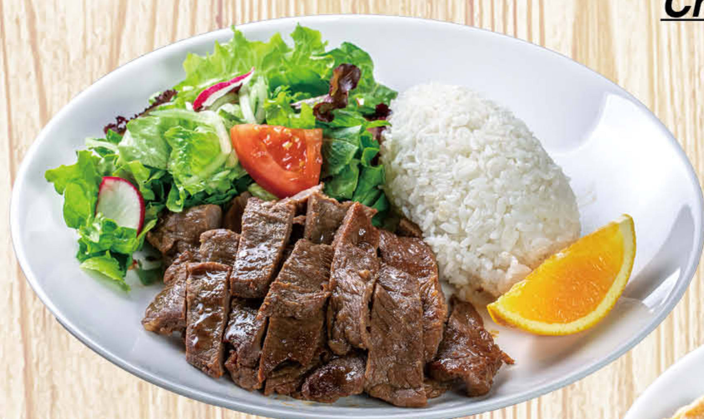
Beef Teriyaki Plate $18.69