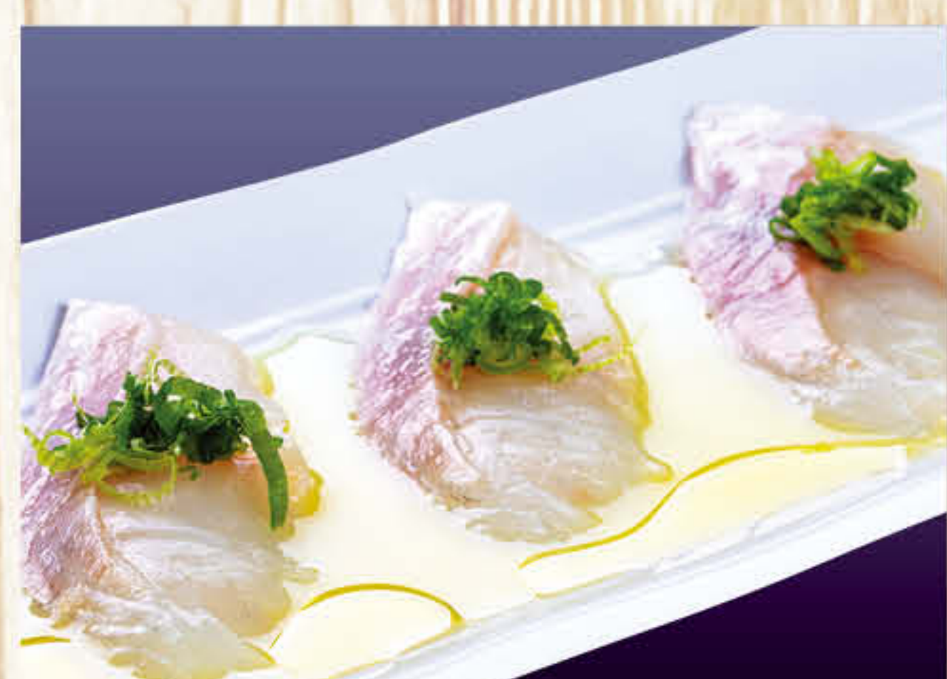
*Snapper Yuzu Sauce Sashimi $11.37