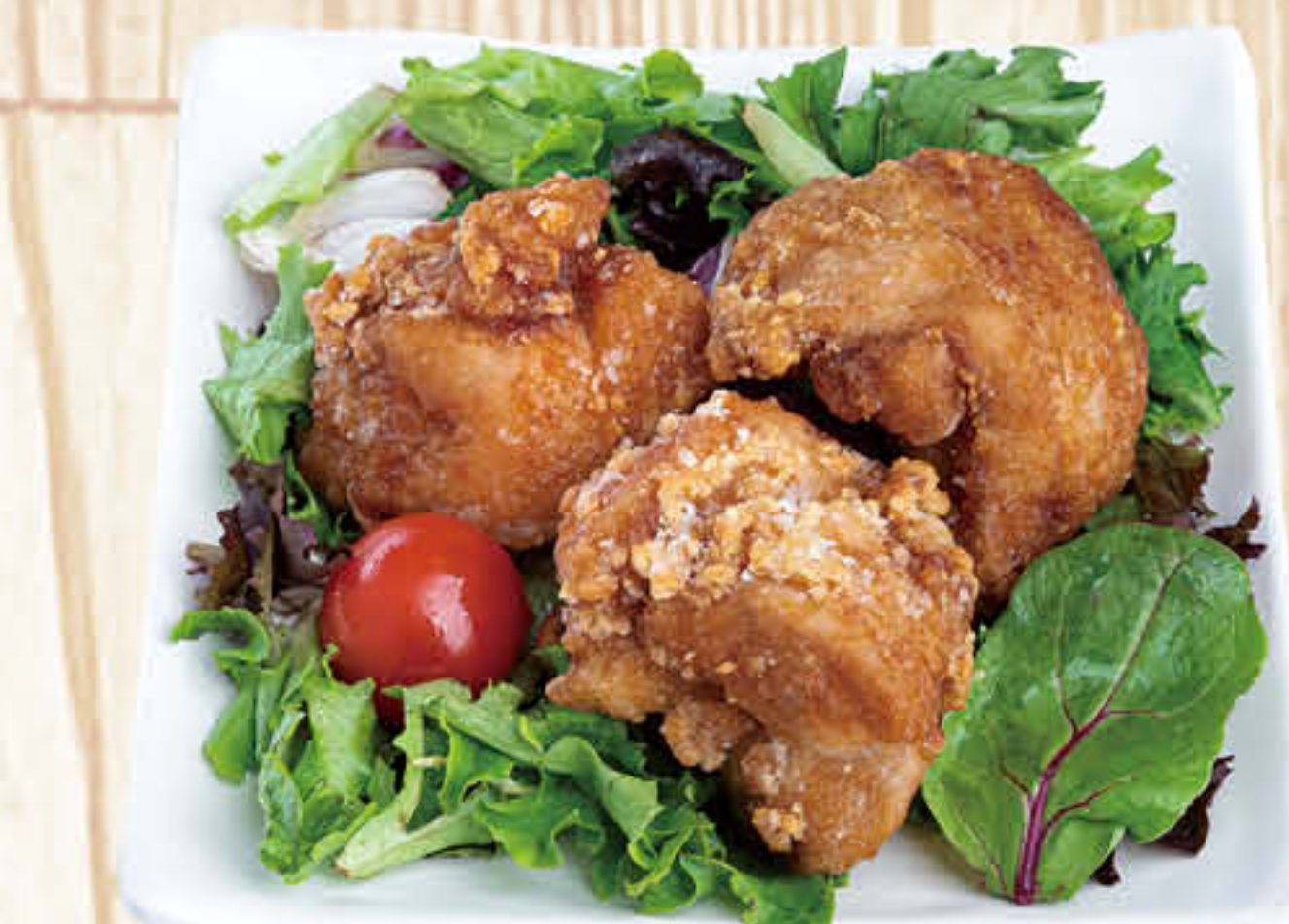
New Chicken Karaage $5.71