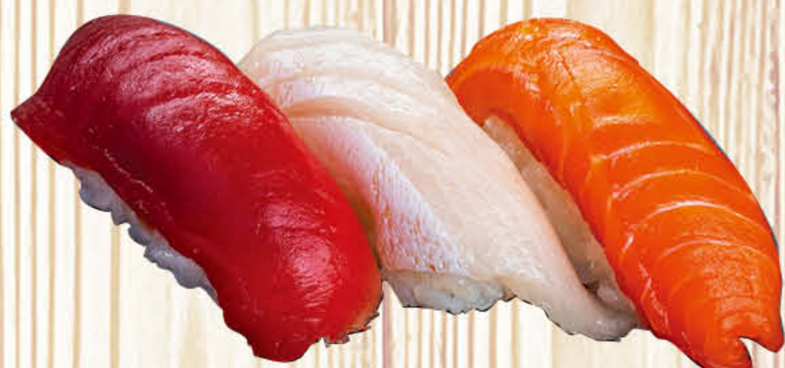
*Yokozuna Trio Sushi $7.63