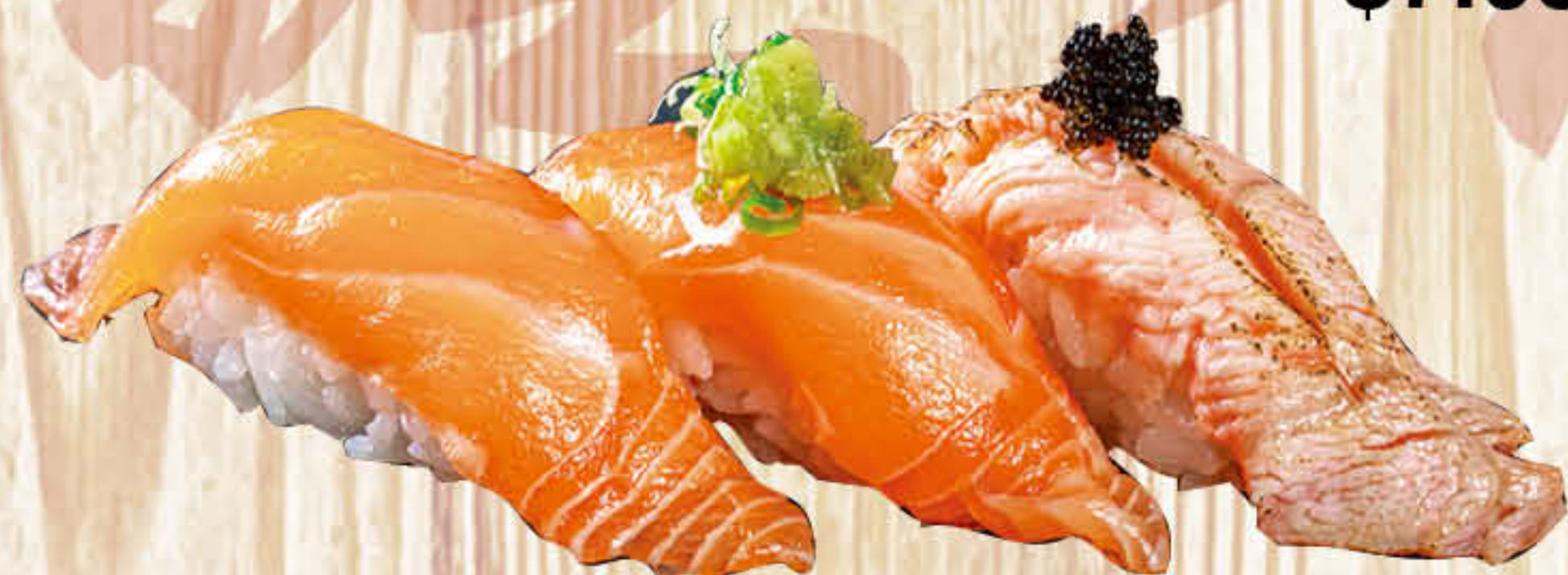
*Salmon Sampler Sushi $7.19